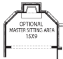
Optional Master Sitting Area