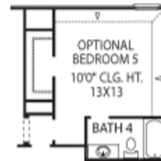
Optional Bedroom 5