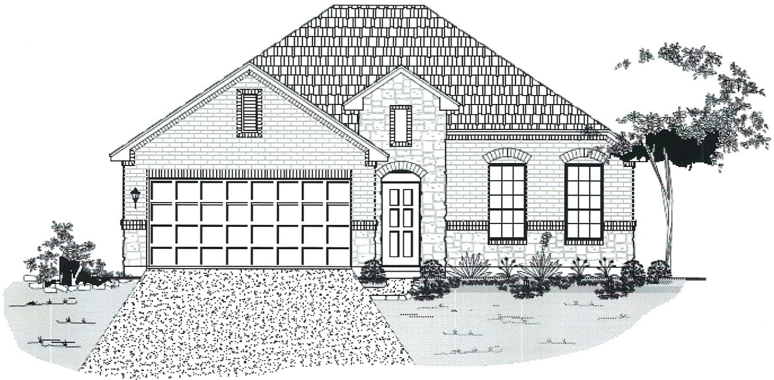
FRONT ELEVATION "A" Plan 1289-L

Brochure plans are artist depictions and may vary from actual plan. Square footages, room dimensions, prices, specifications, materials, and availability of homes by community may vary, and are subject to change without notice.