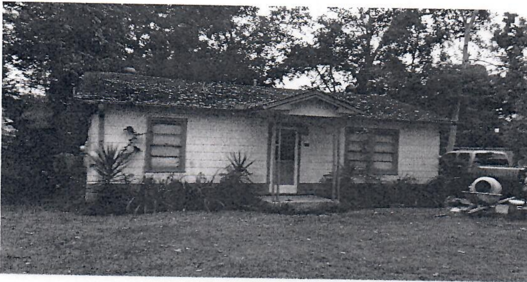
Front of Home 11-1-16

If using the Elevation Certificate to obtain NFIP flood insurance, affix at least 2 building photographs below according to the instructions for Item A6. Identify all photographs with date taken; "Front view" and Rear view"; and, if required, "Right Side View" and "Left Side View." When applicable, photographs must show the foundation with representative examples of the flood openings or vents, as indicated in Section A8. If submitting more photographs than will fit on this page, use the Continuation Page.