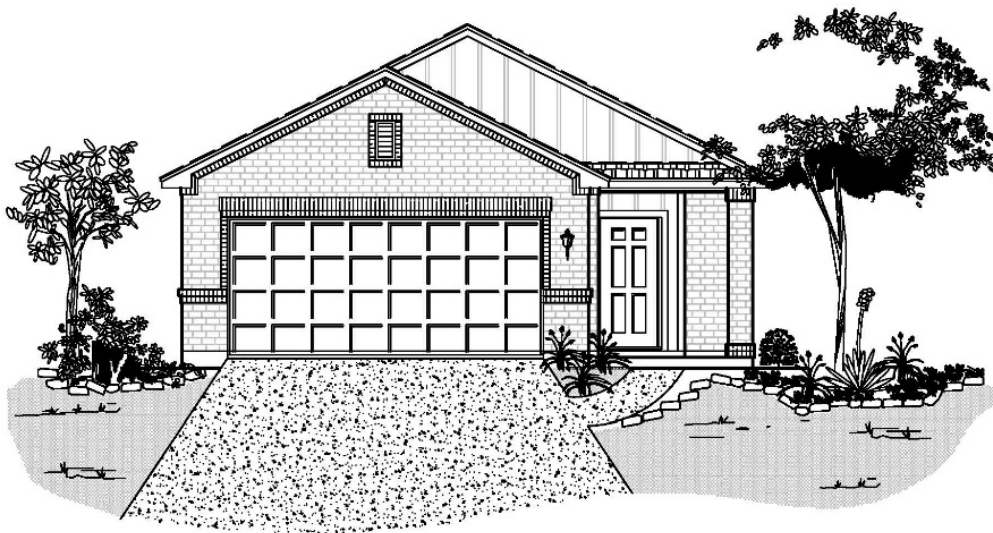
FRONT ELEVATION "B"

Brochure plans are artist depictions and may vary from actual plan. Square footages, room dimensions, prices, specifications, materials, and availability of homes by community may vary, and are subject to change without notice.