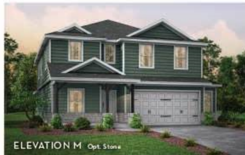
ELEVATION M Opt. Stone