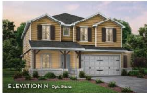
ELEVATION N Opt. Stone