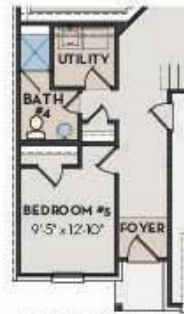
OPT. BEDROOM #5 OR PER ELEVATION