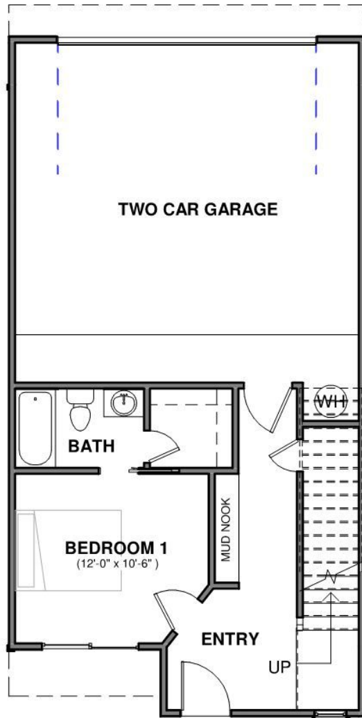
1/ First Floor 1/8" = 1'-0"