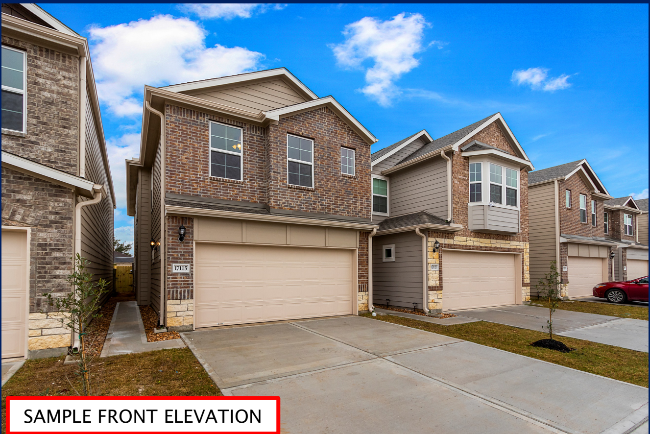
SAMPLE FRONT ELEVATION

Skymark Homes - Features, plans, specifications and pricing are subject to change without prior notice and may differ slightly in homes according to start date. Square footages are approximate. All information is from third-party sources and its accuracy cannot be guaranteed.