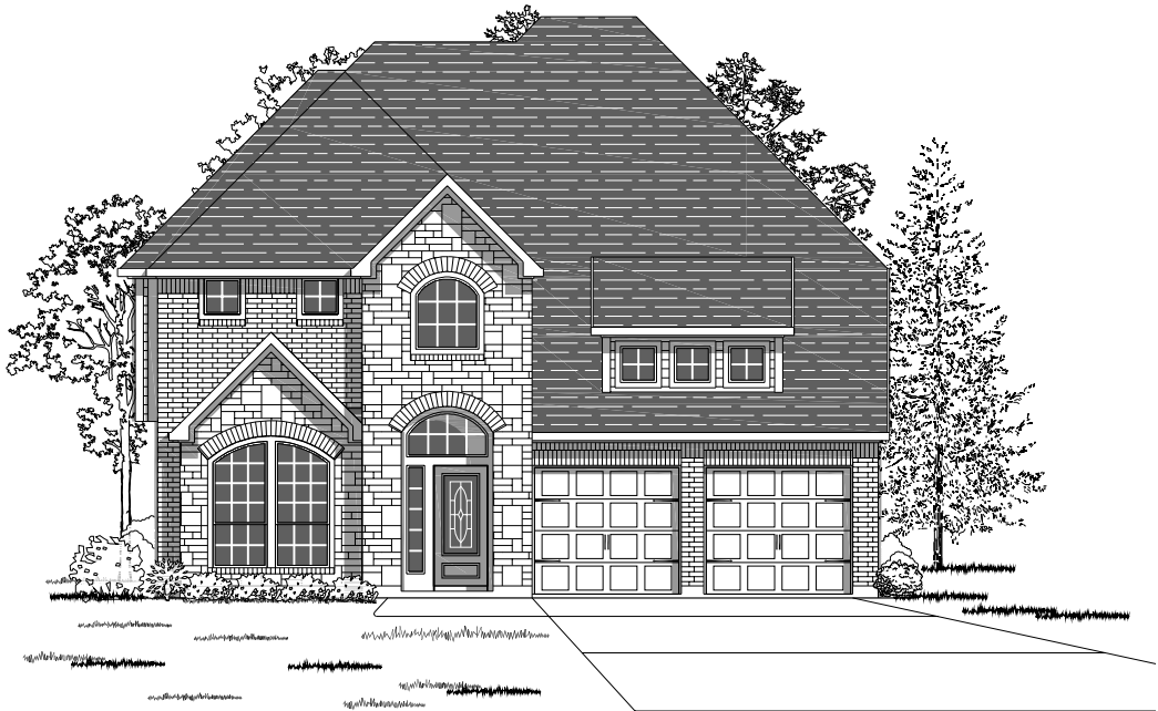
Design 2950W E-50