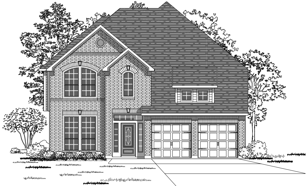
Design 2950W E-2