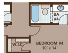
Opt. Bath #4