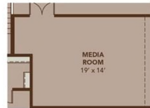
Opt. Media Room