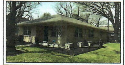
1003 EAST 14TH STREET

THIS PROPERTY IS NOT IN THE 100 YEAR FLOOD ZONE.