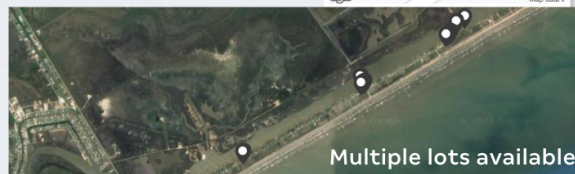
Multiple lots available