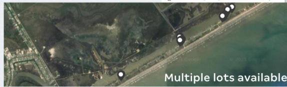
Multiple lots available