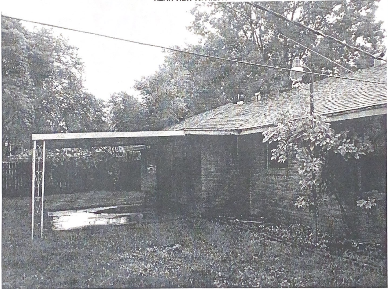
REAR VIEW 09/11/2015

If submitting more photographs than will fit on the preceding page, affix the additional photographs below. Identify all photographs with: date taken; "Front View" and "Rear View"; and, if required, "Right Side View" and "Left Side View." When applicable, photographs must show the foundation with representative examples of the flood openings or vents, as indicated in Section A8.