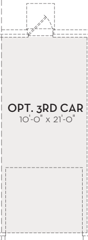
OPT. 3RD CAR 10'-0" x 21'-0"