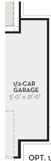
OPT. 1/2 CAR GARAGE PLAN PER ELEVATION