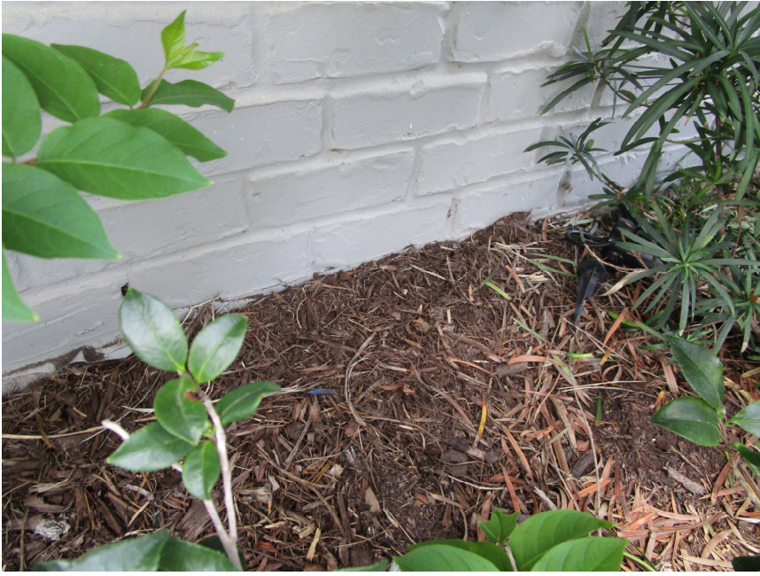
Soil line too high