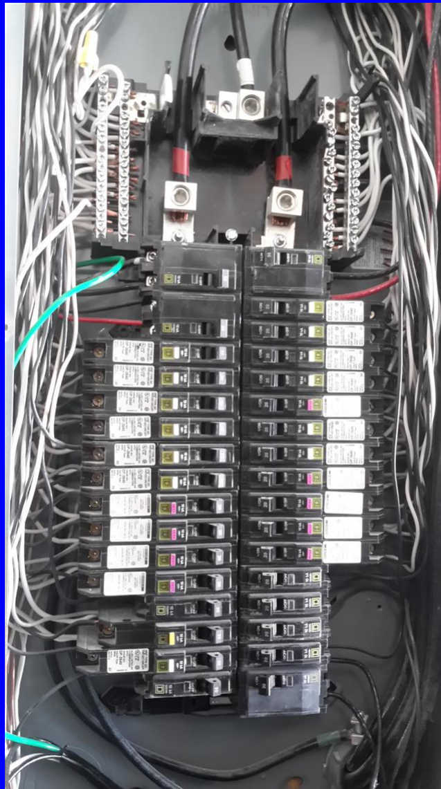
200 amp main panel located in garage