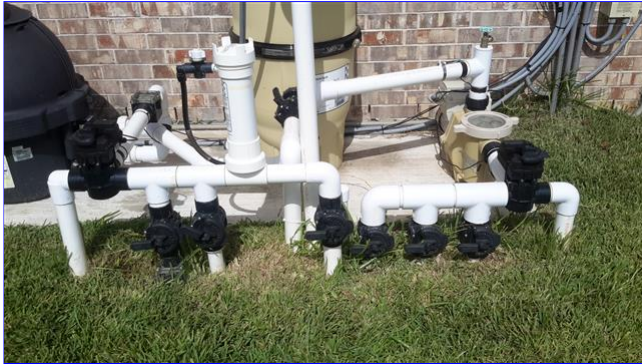
B. Item 1(Picture)