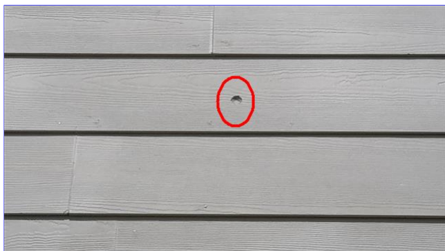
E. Item 2(Picture) Right side of home

(2) The Siding exterior damaged. Further deterioration can occur if not corrected. A qualified person should repair or replace as needed.