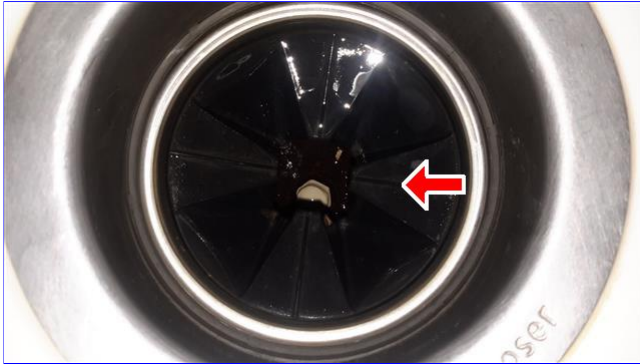
B. Item 1(Picture)