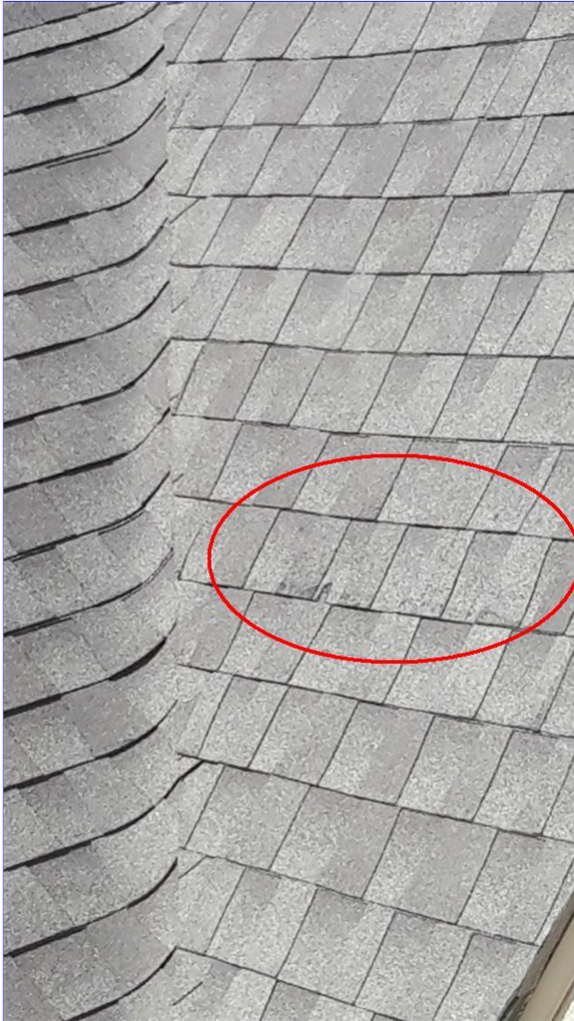
C. Item 2(Picture) Front of home