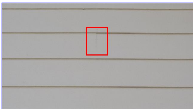
E. Item 4(Picture) deteriorated caulking rear of the home

(4) The soffit panel at eave on the exterior damaged. This is a small repair. A qualified person should repair or replace as needed.