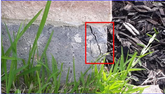
A. Item 1(Picture) Front left corner of home