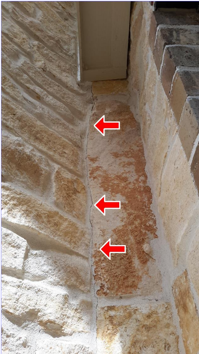
E. Item 1(Picture) Right of main entry

(1) The stone siding has hairline cracks in mortar. Further deterioration can occur if not corrected. A qualified person should repair or replace as needed.