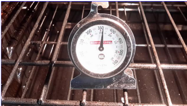
D. Item 2(Picture) Oven tested set at 350 ( f ) degrees