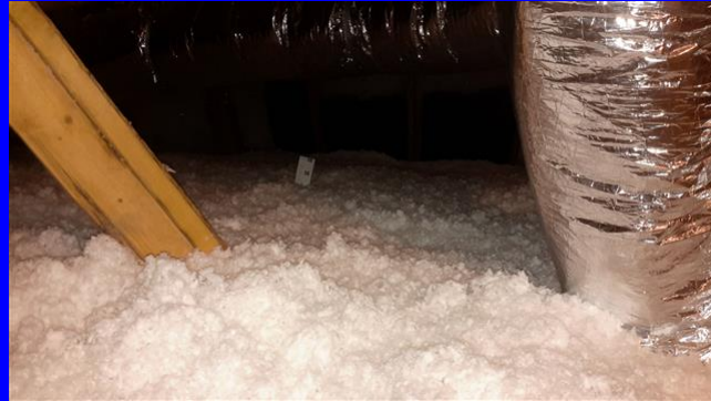
12 inches blown insulation

The Home Inspector shall observe structural components including foundations, floors, walls, columns or piers, ceilings and roof. The home inspector shall describe the type of Foundation, floor structure, wall structure, columns or piers, ceiling structure, roof structure. The home inspector shall: Probe structural components where deterioration is suspected; Enter under floor crawl spaces, basements, and attic spaces except when access is obstructed, when entry could damage the property, or when dangerous or adverse situations are suspected; Report the methods used to observe under floor crawl spaces and attics; and Report signs of abnormal or harmful water penetration into the building or signs of abnormal or harmful condensation on building components. The home inspector is not required to: Enter any area or perform any procedure that may damage the property or its components or be dangerous to or adversely effect the health of the home inspector or other persons.