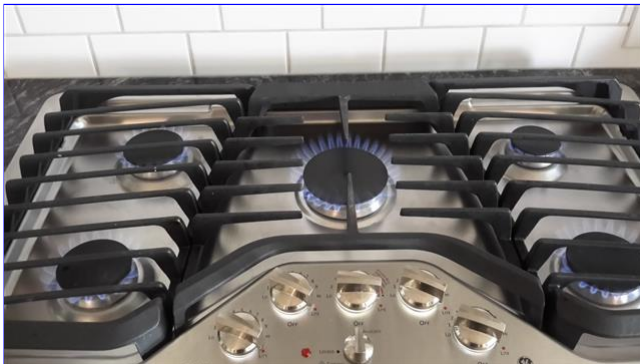
D. Item 1(Picture)

Tested and working properly at the time of inspection.