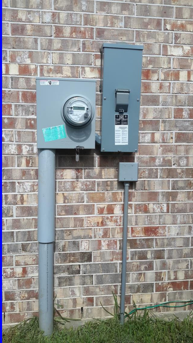
Below ground service right side of home