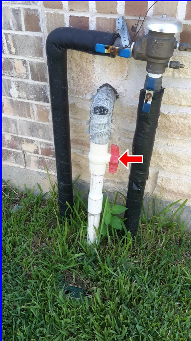
Water main shut off left side of home