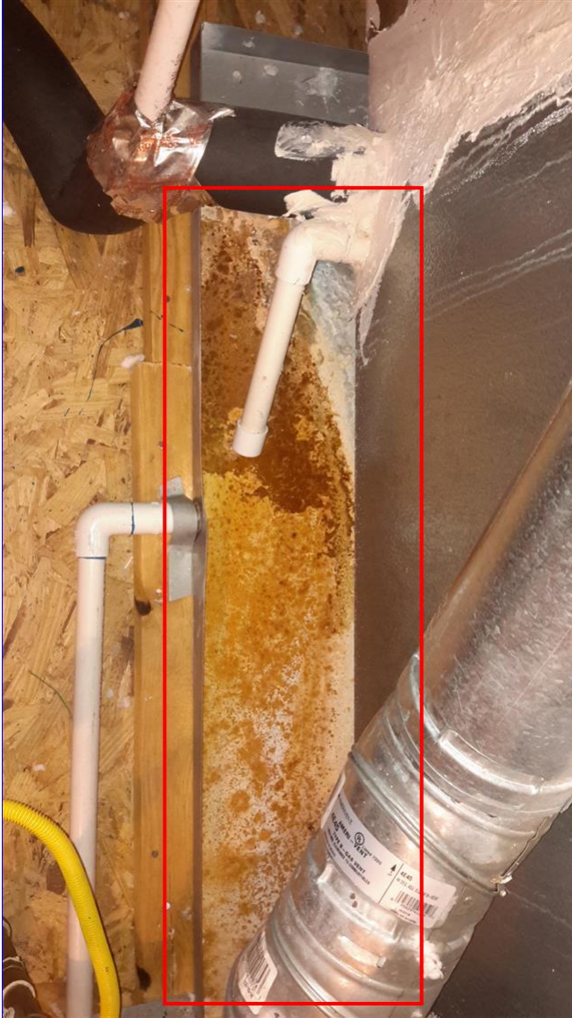
B. Item 1(Picture)