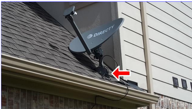
C. Item 1(Picture)