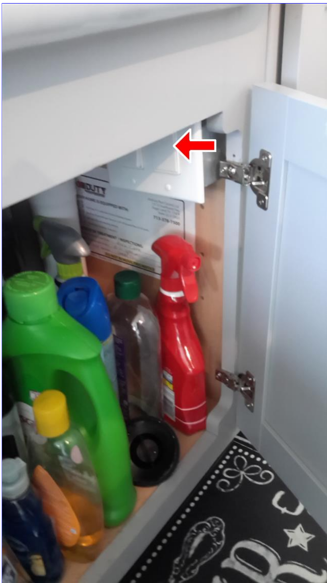
A. Item 1(Picture)