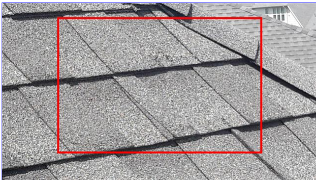
C. Item 3(Picture) Rear of home