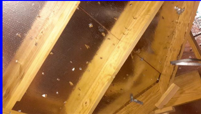
Roof structure stick built 2x6 rafters with radiant barrier decking