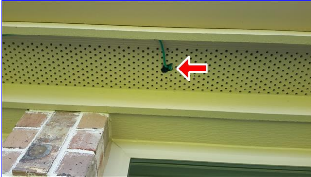
E. Item 5(Picture) left side of home