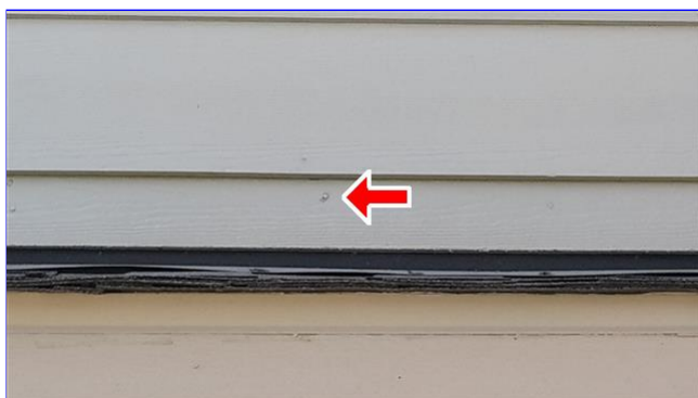
E. Item 3(Picture) lifted nail rear of the home

(3) The siding exterior has caulking that is weathered or missing and some lifted nails. Deterioration can eventually occur if not corrected. A qualified person should repair as needed.