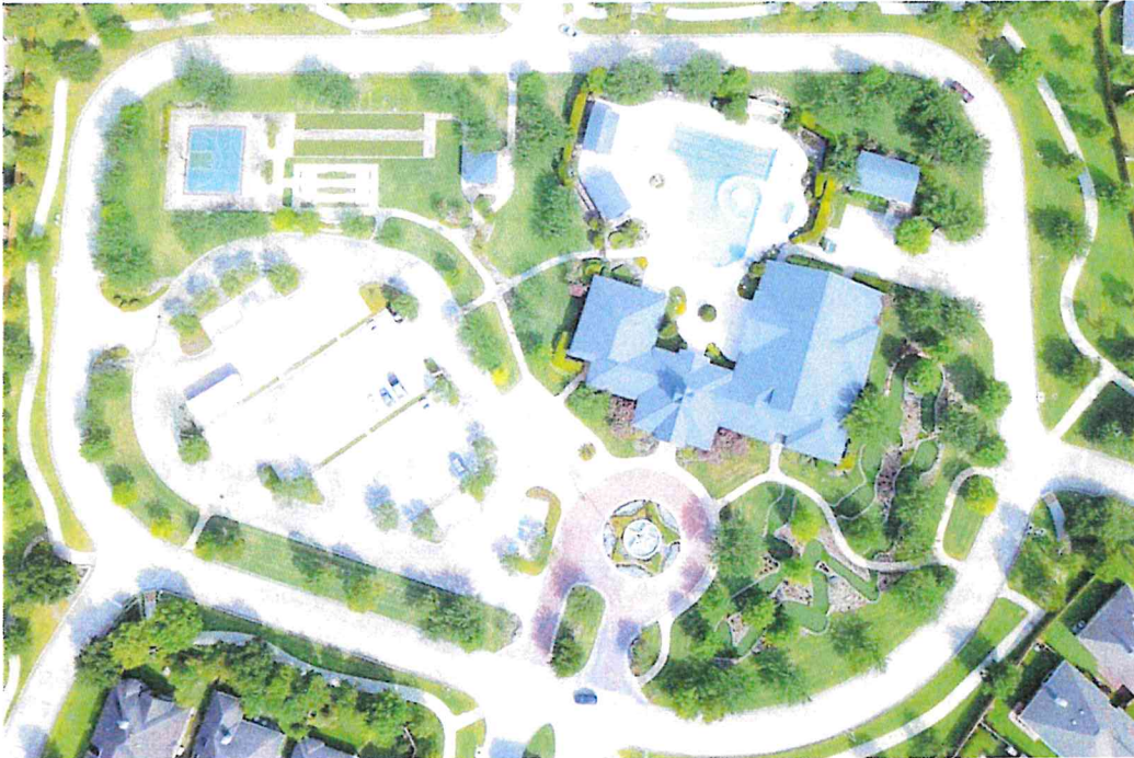
Aerial view of Heritage Circle enclosing common property of Heritage Grand

A monthly HOA assessment fee is required. Please refer to the attached table for the assessment fee amount and a summary of amenities provided by the fee.