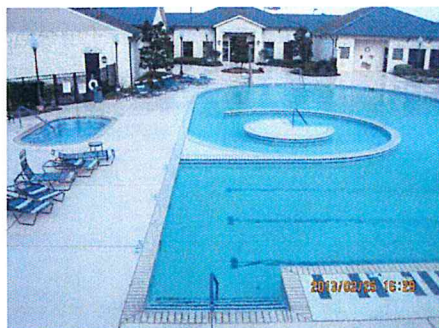
Heated swimming pool