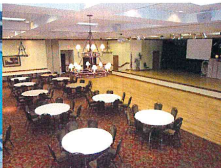
ballroom and stage