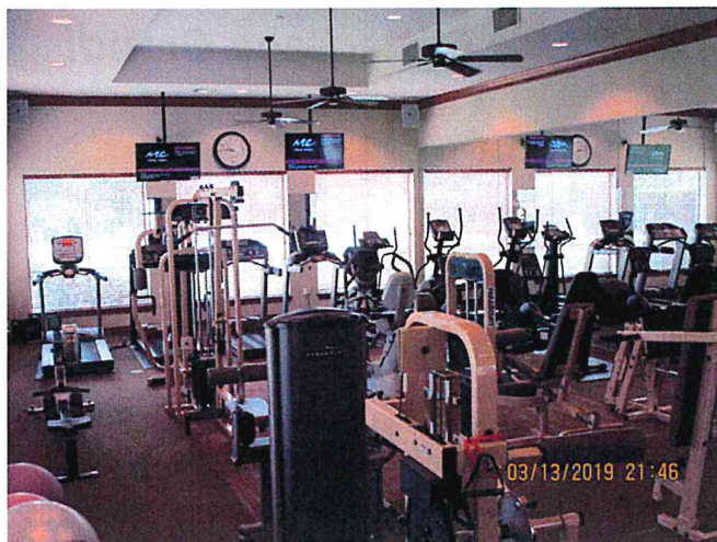
The fitness center at the clubhouse is available 24/7.