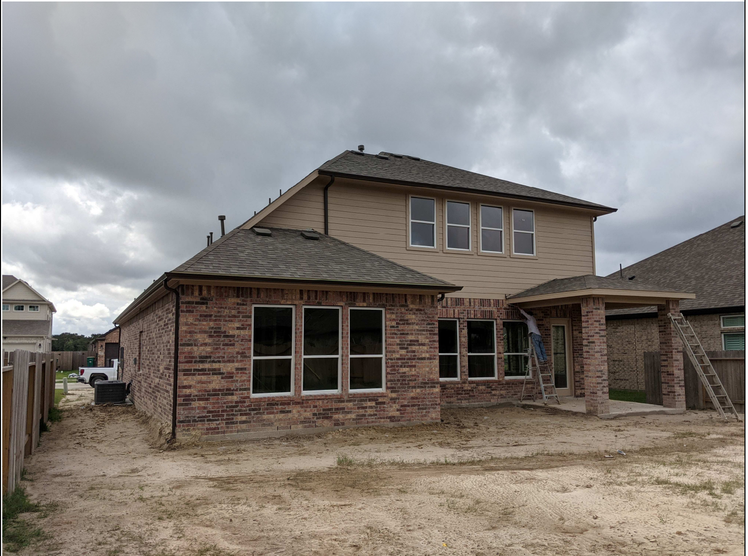
REAR RIGHT VIEW 10/26/21

If submitting more photographs than will fit on the preceding page, affix the additional photographs below. Identify all photographs with: date taken; "Front View" and "Rear View"; and, if required, "Right Side View" and "Left Side View." When applicable, photographs must show the foundation with representative examples of the flood openings or vents, as indicated in Section A8.