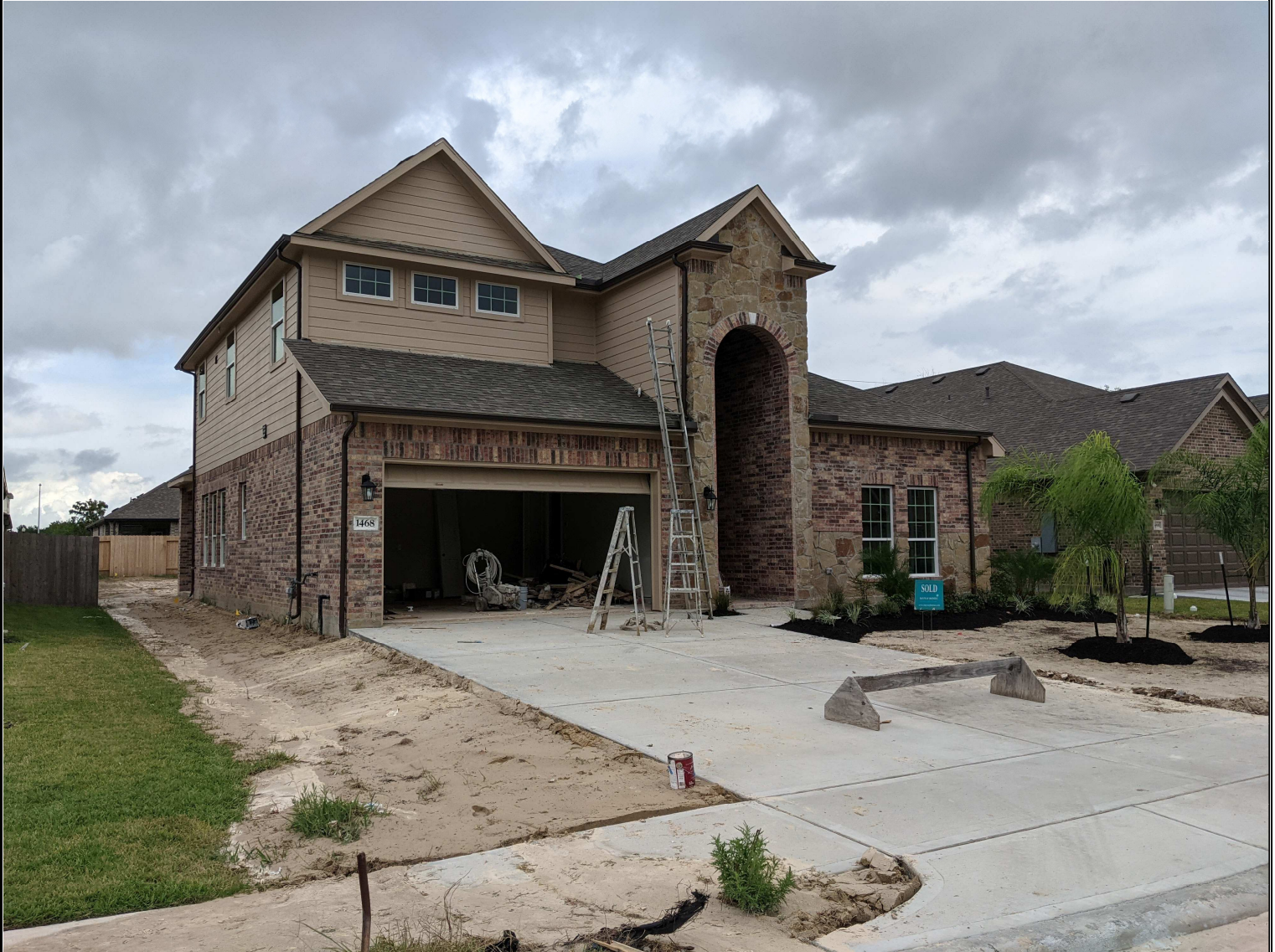
FRONT LEFT VIEW 10/26/21

If using the Elevation Certificate to obtain NFIP flood insurance, affix at least 2 building photographs below according to the instructions for Item A6. Identify all photographs with date taken; "Front View" and "Rear View"; and, if required, "Right Side View" and "Left Side View." When applicable, photographs must show the foundation with representative examples of the flood openings or vents, as indicated in Section A8. If submitting more photographs than will fit on this page, use the Continuation Page.