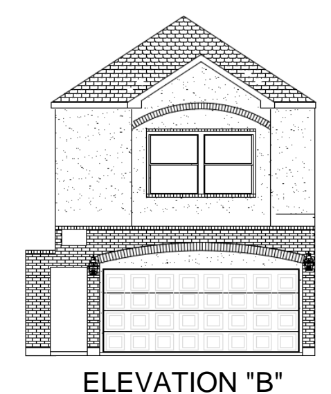
TOTAL LIVING AREA: 2469 SQ.FT.

TOTAL LIVING AREA: 2469 SQ.FT. TOTAL LIVING AREA: 2469 SQ.FT.