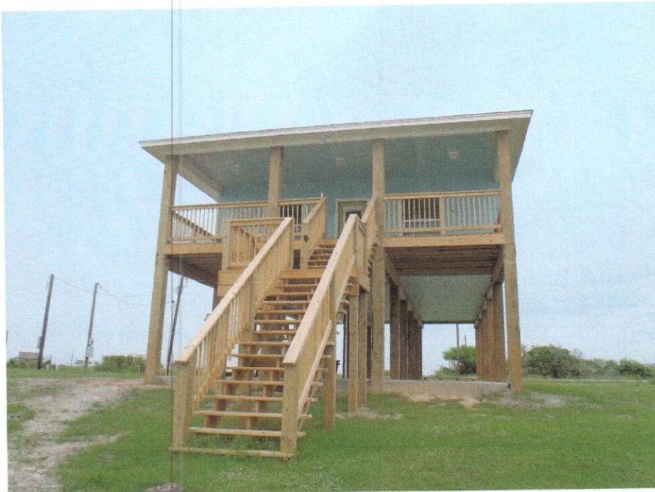
REAR VIEW 09/23/2013

If submitting more photographs than will fit on the preceding page, affix the additional photographs below. Identify all photographs with: date taken; "Front View" and "Rear View"; and, if required, "Right Side View" and "Left Side View." When applicable, photographs must show the foundation with representative examples of the flood openings or vents, as indicated in Section A8.