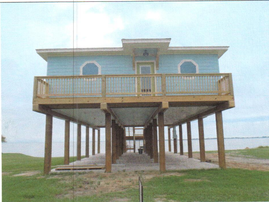
FRONT VIEW 09/23/2013

If using the Elevation Certificate to obtain NFIP flood insurance, affix at least 2 building photographs below according to the instructions for Item A6. Identify all photographs with date taken; "Front View" and "Rear View"; and, if required, "Right Side View" and "Left Side View." When applicable, photographs must show the foundation with representative examples of the flood openings or vents, as indicated in Section A8. If submitting more photographs than will fit on this page, use the Continuation Page.