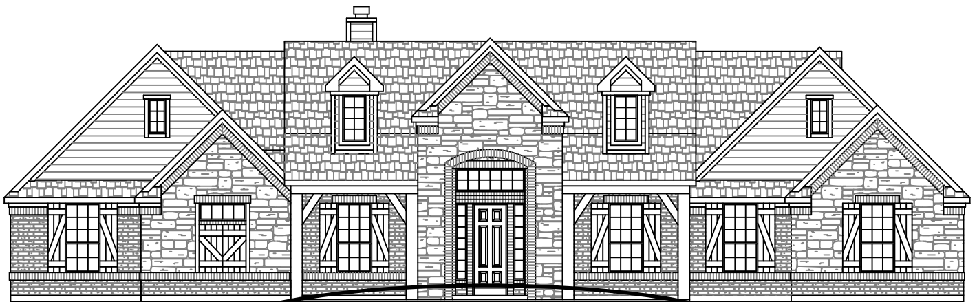
FRONT ELEVATION "B"