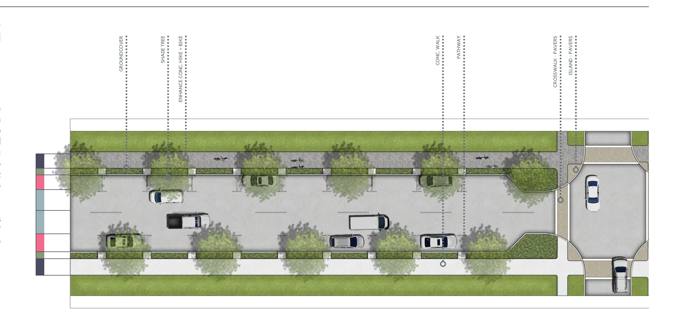
FIGURE 1.6.1 1st 3rd 5th Street Typology

For pedestrian movement, this typology includes a 8'-0" walks suitbale for walking and biking. Where necessary, the 8'-0" walk can be constructed at the back of curb to allow for the preservation of large existing trees.