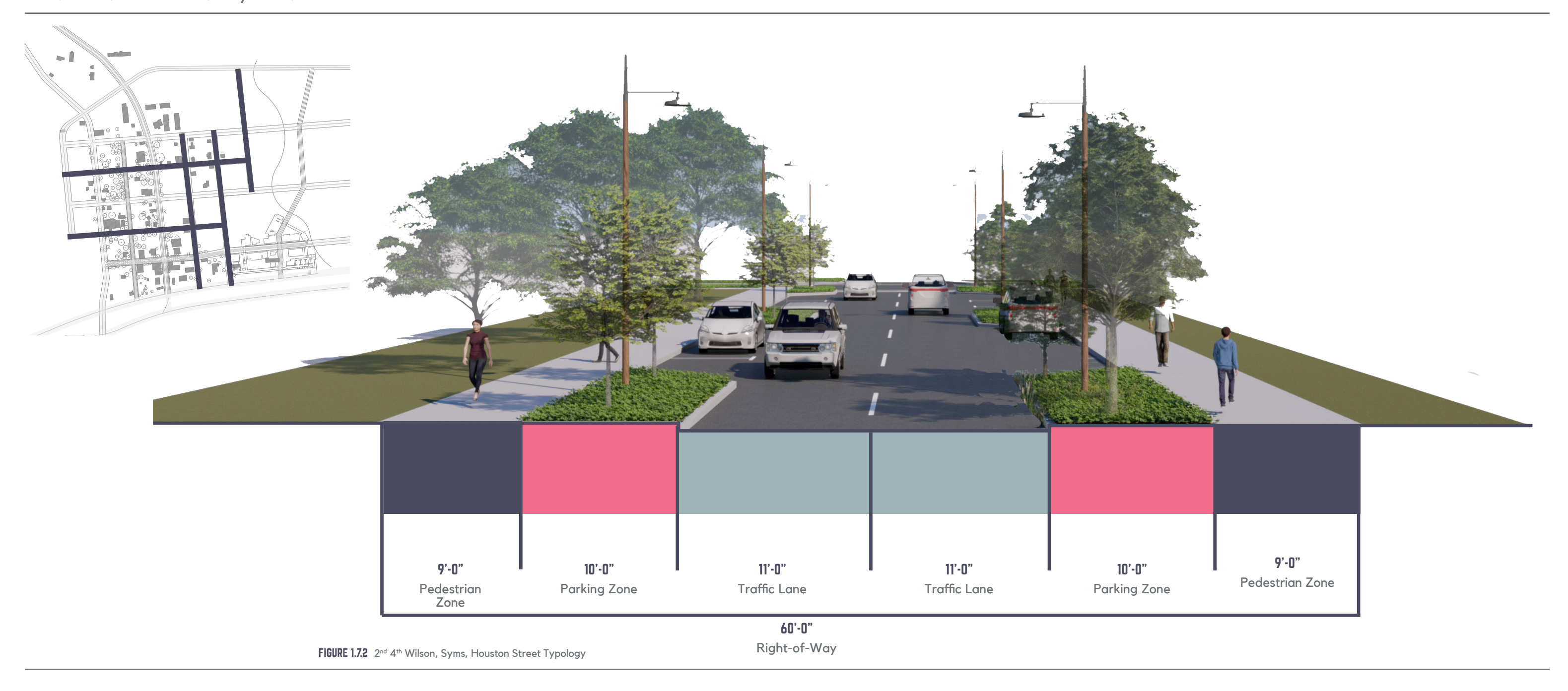
2<sup>nd</sup>, 4<sup>th</sup>, Wilson, Syms, & Houston Streets