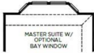
OPTIONAL MASTER SUITE