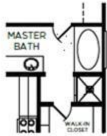
MASTER BATH OPTION