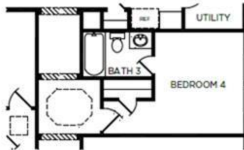
BEDROOM 4 WITH BATH 3 OPTION