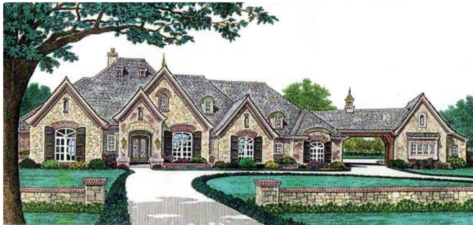
Plan Number 66248 | Order Code: 00WEB | Elevation