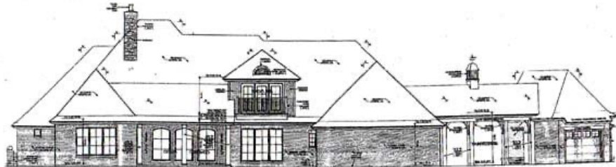
Plan Number 66248 | Order Code: 00WEB | Rear Elevation