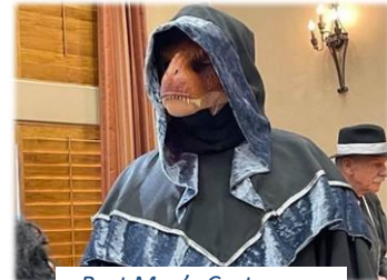
Best Men's Costume