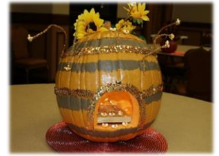
Best Decorated Pumpkin