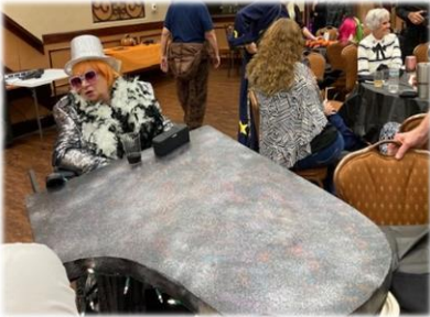
Best Ladies' Costume