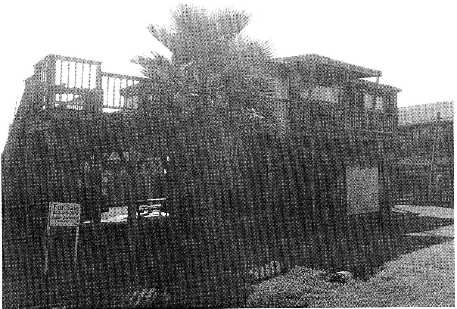
FRONT VIEW 07/25/2014

If using the Elevation Certificate to obtain NFIP flood insurance, affix at least 2 building photographs below according to the instructions for Item A6. Identify all photographs with date taken; "Front View" and "Rear View"; and, if required, "Right Side View" and "Left Side View." When applicable, photographs must show the foundation with representative examples of the flood openings or vents, as indicated in Section A8. If submitting more photographs than will fit on this page, use the Continuation Page.