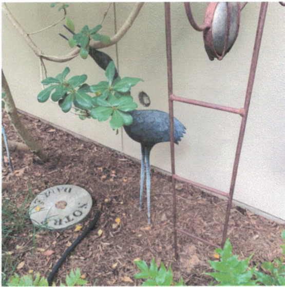
Other Treatment Photos

Please keep foundation exposed at least 2 to 3 inches