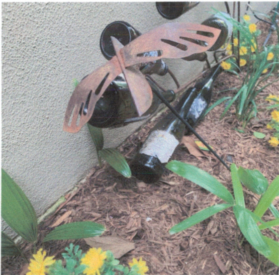
Other Treatment Photos