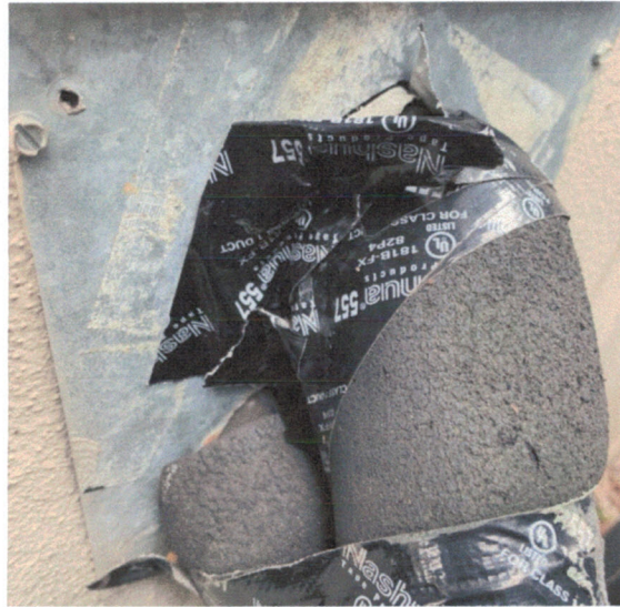
Exclusion/Points of Entry