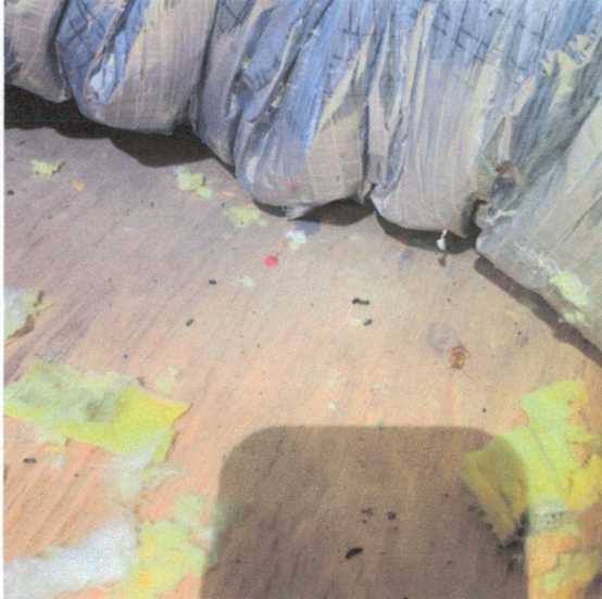
Exclusion/Points of Entry

Rodent droppings inside attic, rodent exclusion recommended