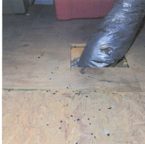
Exclusion/Points of Entry

Rodent droppings inside attic, rodent exclusion recommended