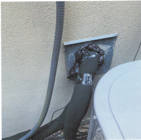
Other Treatment Photos

Thank you for choosing Terminix. Your business is appreciated.