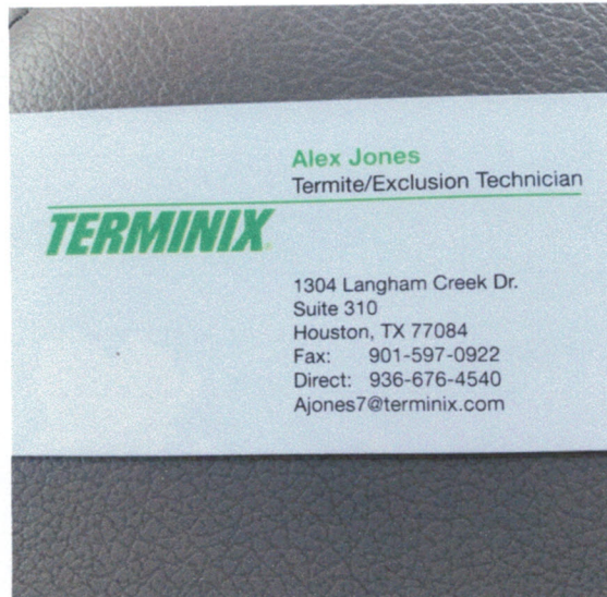
Other Treatment Photos