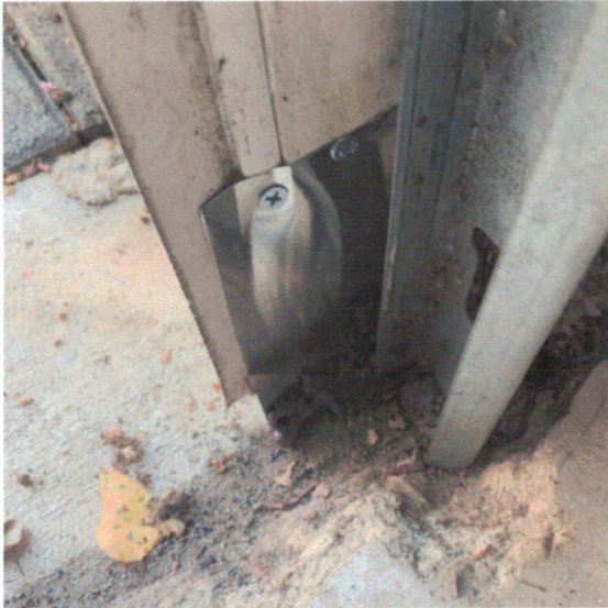
Other Treatment Photos