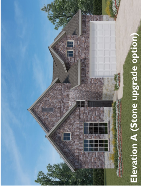
Elevation A (Stone upgrade option)