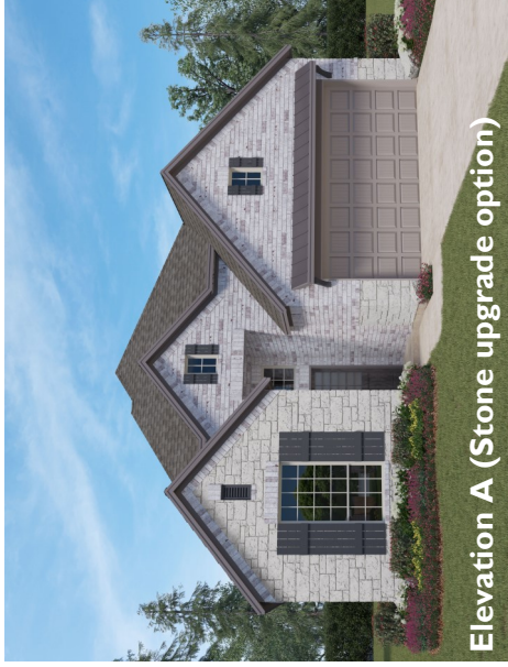
Elevation A (Stone upgrade option)