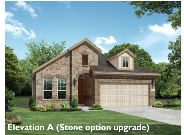
Elevation A (Stone option upgrade)