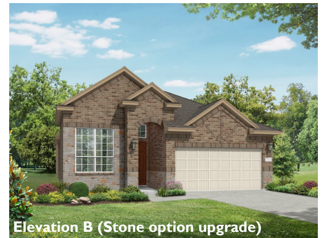
Elevation B (Stone option upgrade)