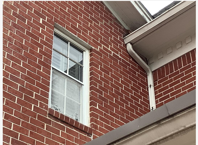
4 - 1