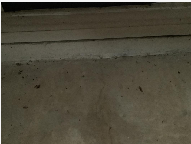
7 - 1