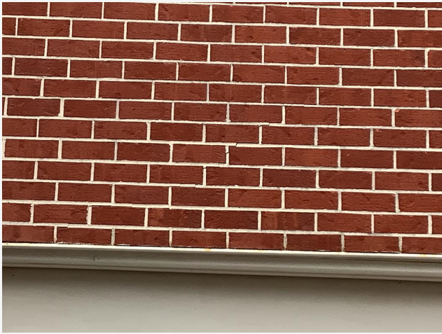
5 - 1