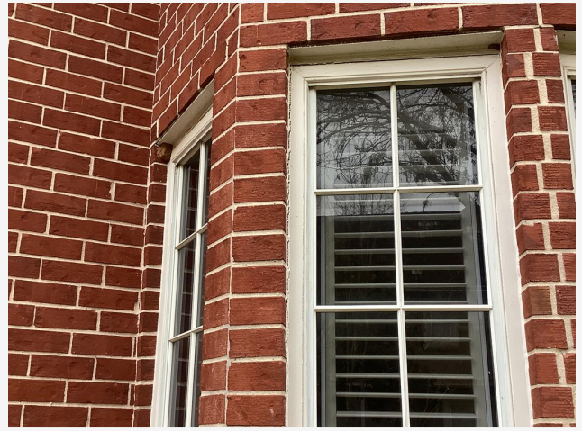
2 - 1