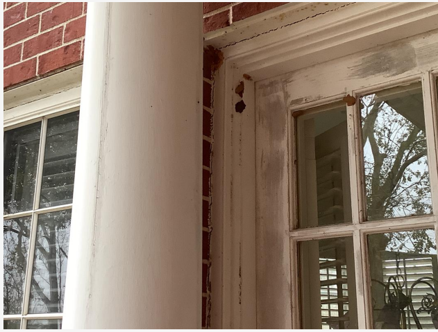
1 - 1