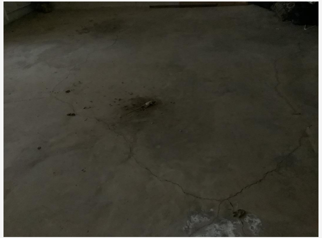
6 - 1