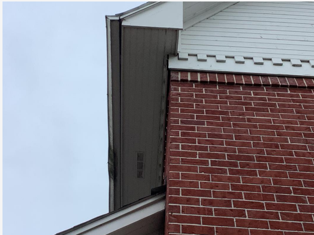
3 - 1