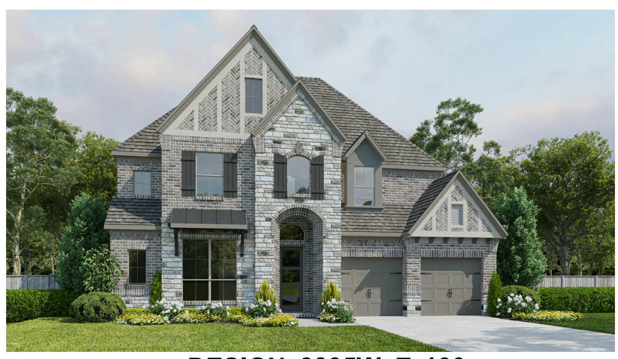
DESIGN 3395W E-100

This design, as originally designed and prior to any changes you make, is estimated to yield approximately the number of square feet shown on page 1. All dimensions are approximate. Square footage may vary based on as-built dimensions, configurations, plan options and/or the method of calculation. Designs are not-to-scale, and are conceptual illustrations that may differ from construction plans or completed improvements. A design may depict features not available on all homesites or in all communities. Perry Homes reserves the right to make changes in plans and specifications, and to substitute material of similar quality. Prices, terms, promotions, plans, dimensions, features, options, amenities, elevations, designs, square footages, specifications, materials, and availability of homes or communities are subject to change without notice or obligation. All obligations will be governed by a written contract. This design does not constitute a commitment to build a particular floor plan or home in any given community Some floor plans, options, and/or elevations may not be available on certain homesites or in a particular community and may require additional charges. Please check with Perry Homes to verify current offerings in the communities are considering. This rendering is the property of Perry Homes 11 C. Any reproduction or exhibition is strictly prohibited @ Perry Homes 11 C. 2020