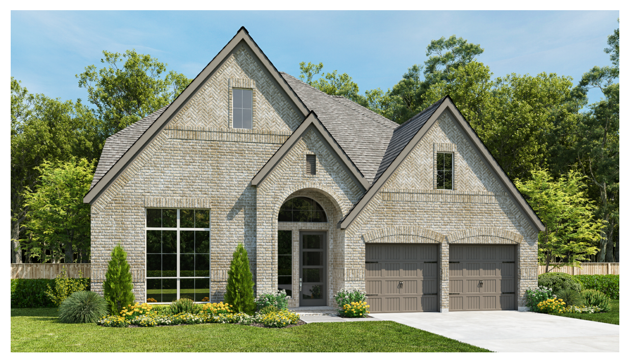
DESIGN 3395W E-1