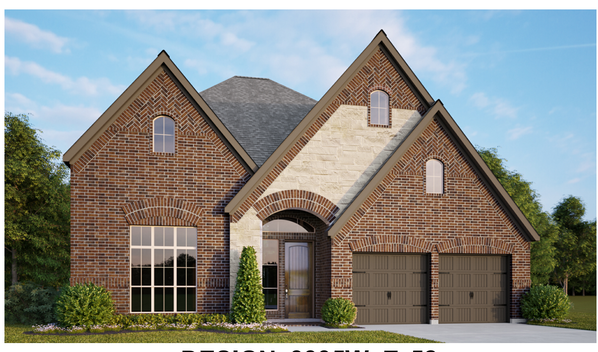
DESIGN 3395W E-52