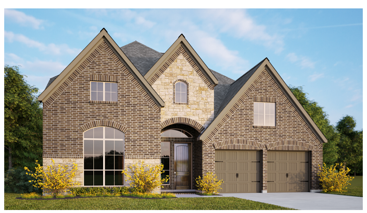
DESIGN 3395W E-50