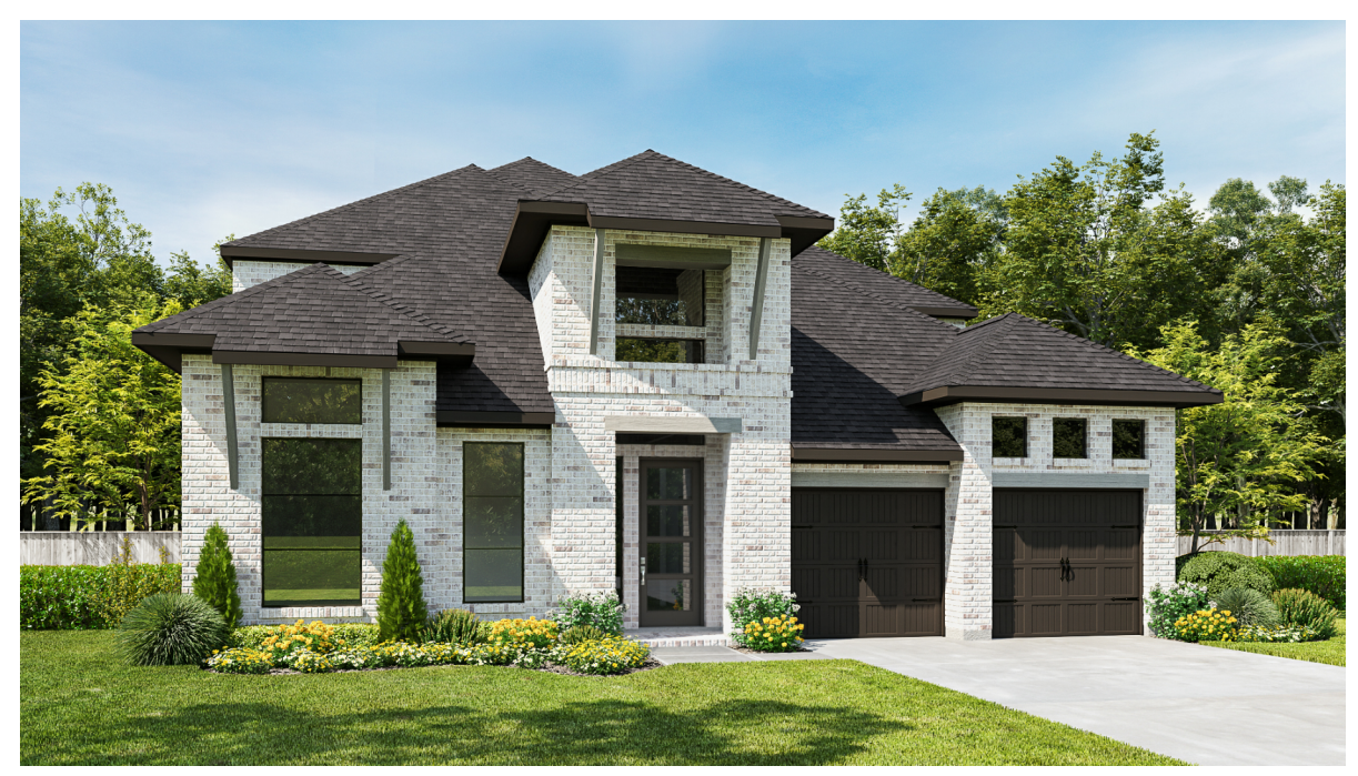
DESIGN 3395W E-72