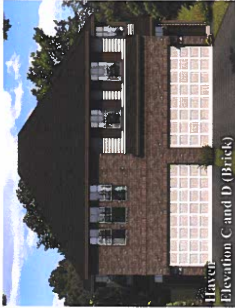
Haven Elevation C and D (Brick)