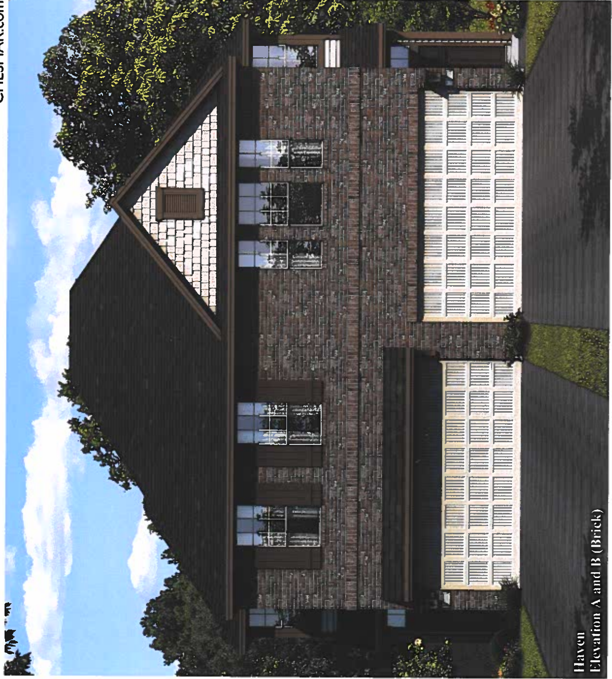
Haven Elevation A and B (Brick)