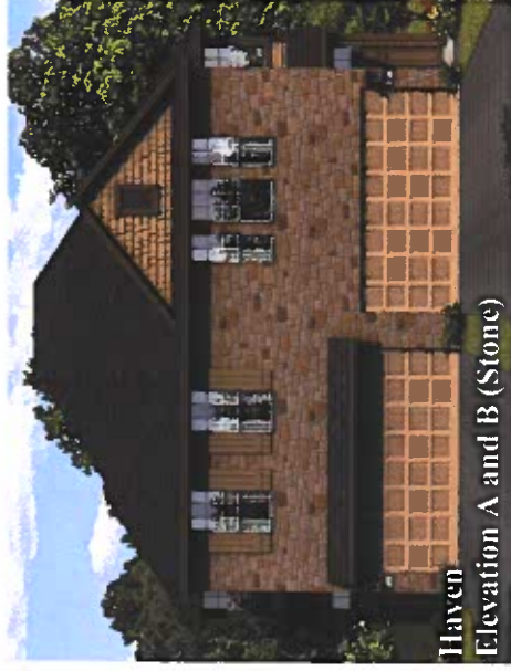
Haven Elevation A and B (Stone)