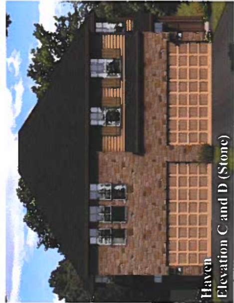
Haven Elevation C and D (Stone)