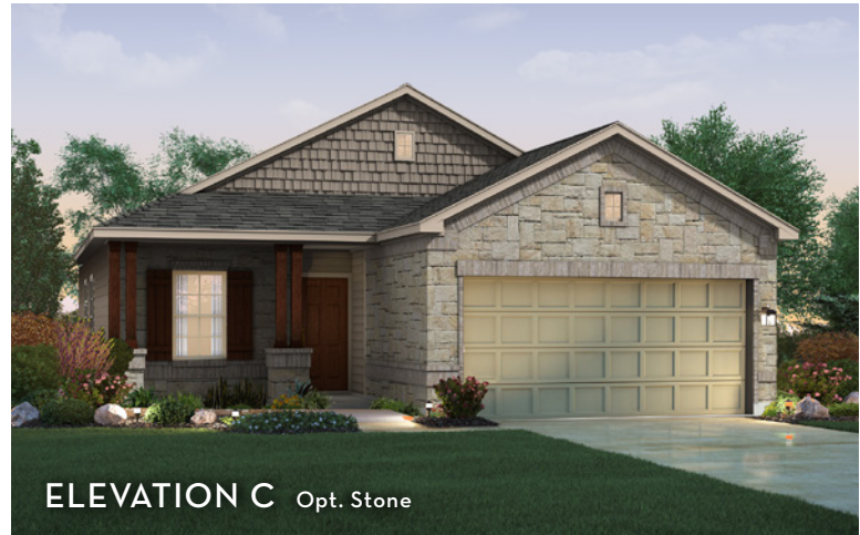
ELEVATION C Opt. Stone