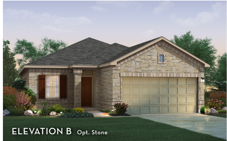
ELEVATION B Opt. Stone