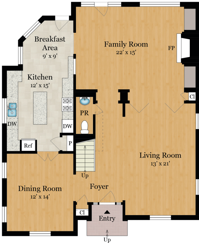
MAIN RESIDENCE MAIN LEVEL