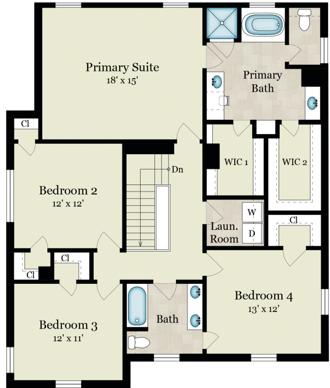
MAIN RESIDENCE UPPER LEVEL