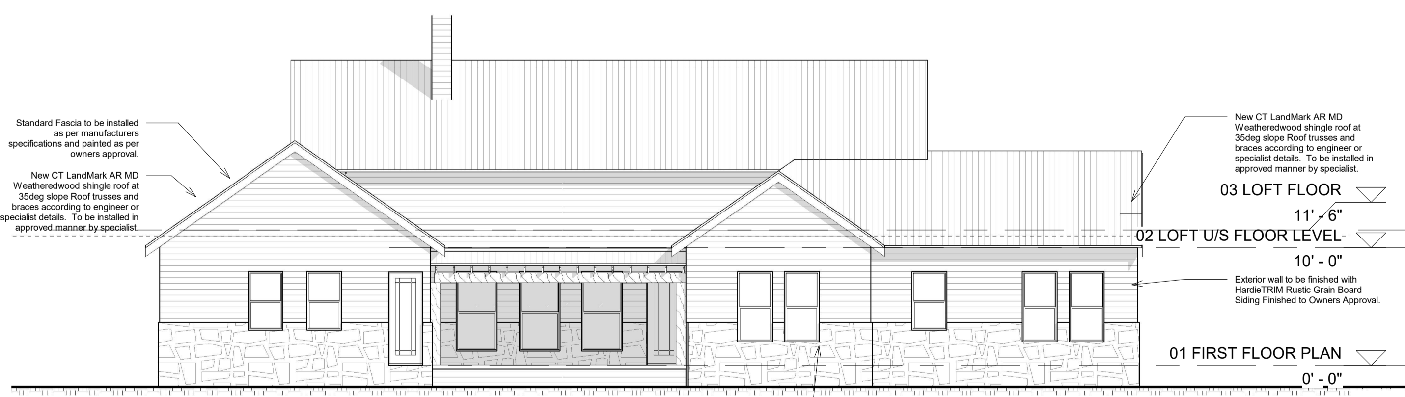
4 SOUTH ELEVATION Copy 1/8" = 1'-0"

FIRST FLOOR PLAN Drawing name PROPOSED NEW RESIDENCE ON STAND ... FOR THE OWNERS. Drawing description 2021067 Project number S.J.van Vuuren - Director (N.DIP. ARCH. PTA. SACAP. ST 0469) L.E Schroeder - Director (B. ARCH. (UP) SACAP 7627) Design Team