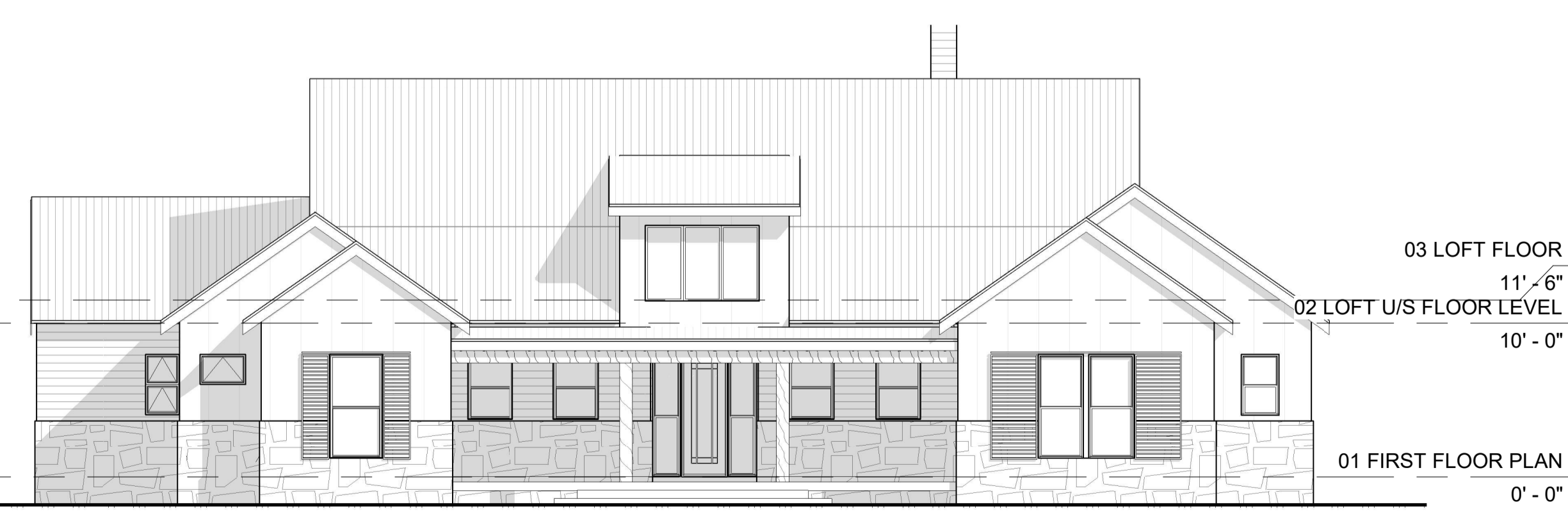
3 NORTH ELEVATION 1/8" = 1'-0"