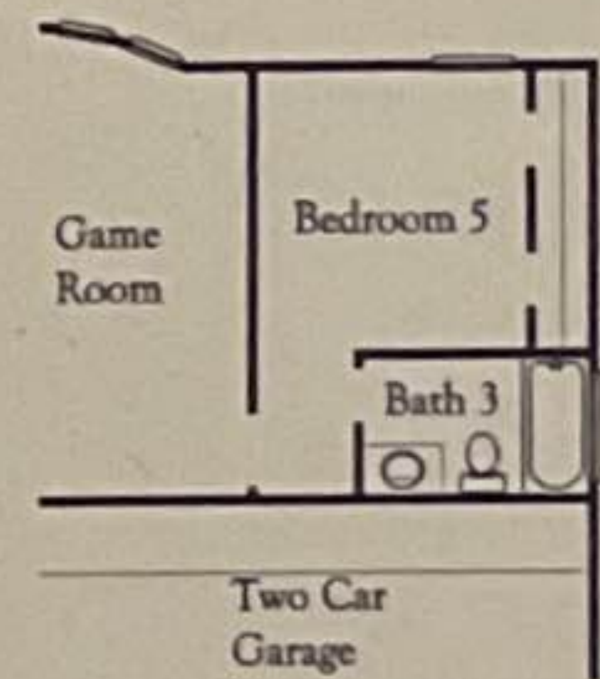
Optional Bedroom 5 with Bath 3