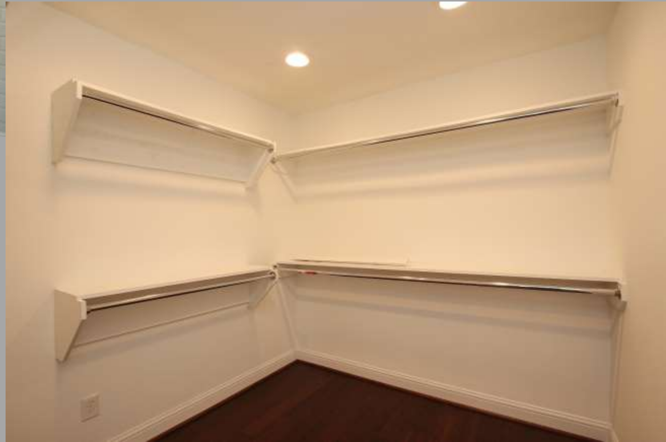
Expanded Primary Suite Walk-In Closet