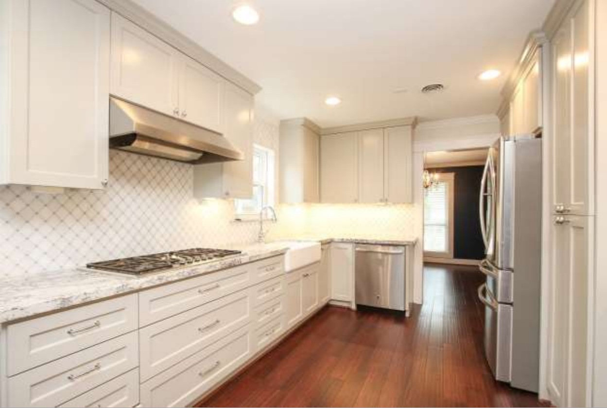
Extensively Remodeled Kitchen