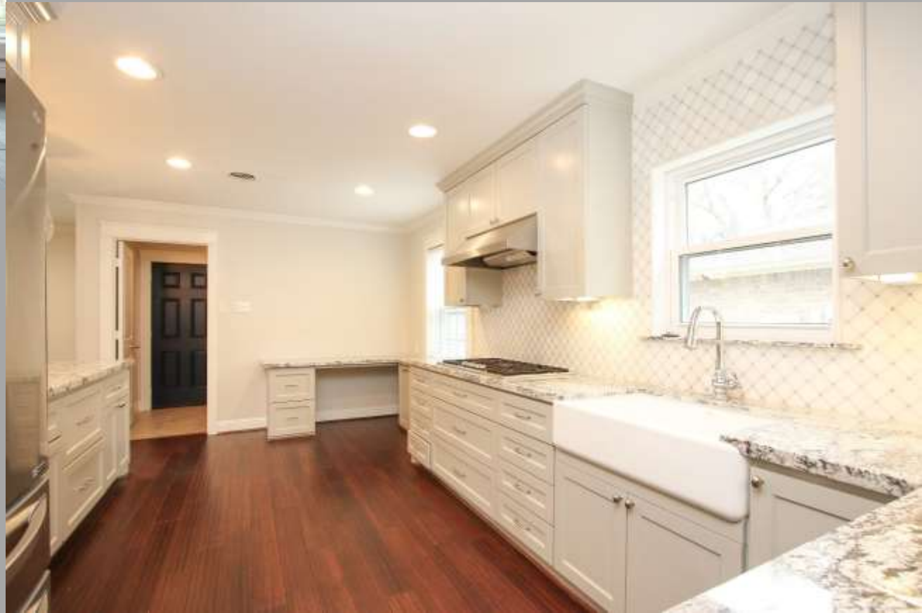
Extensively Remodeled Kitchen