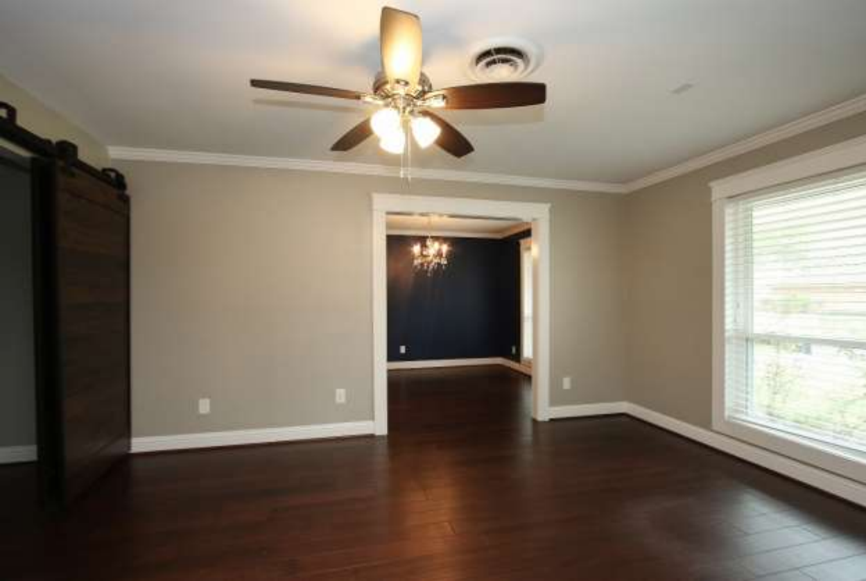
Formal Living Room With View Into Formal Dining Room