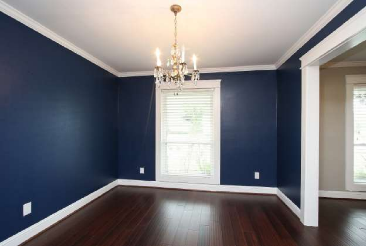
Formal Dining Room With Vintage Chandelier