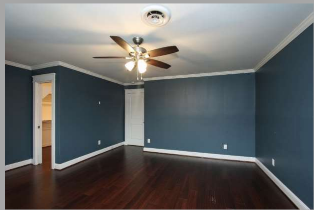
Two Views Of The Spacious Primary Bedroom Suite