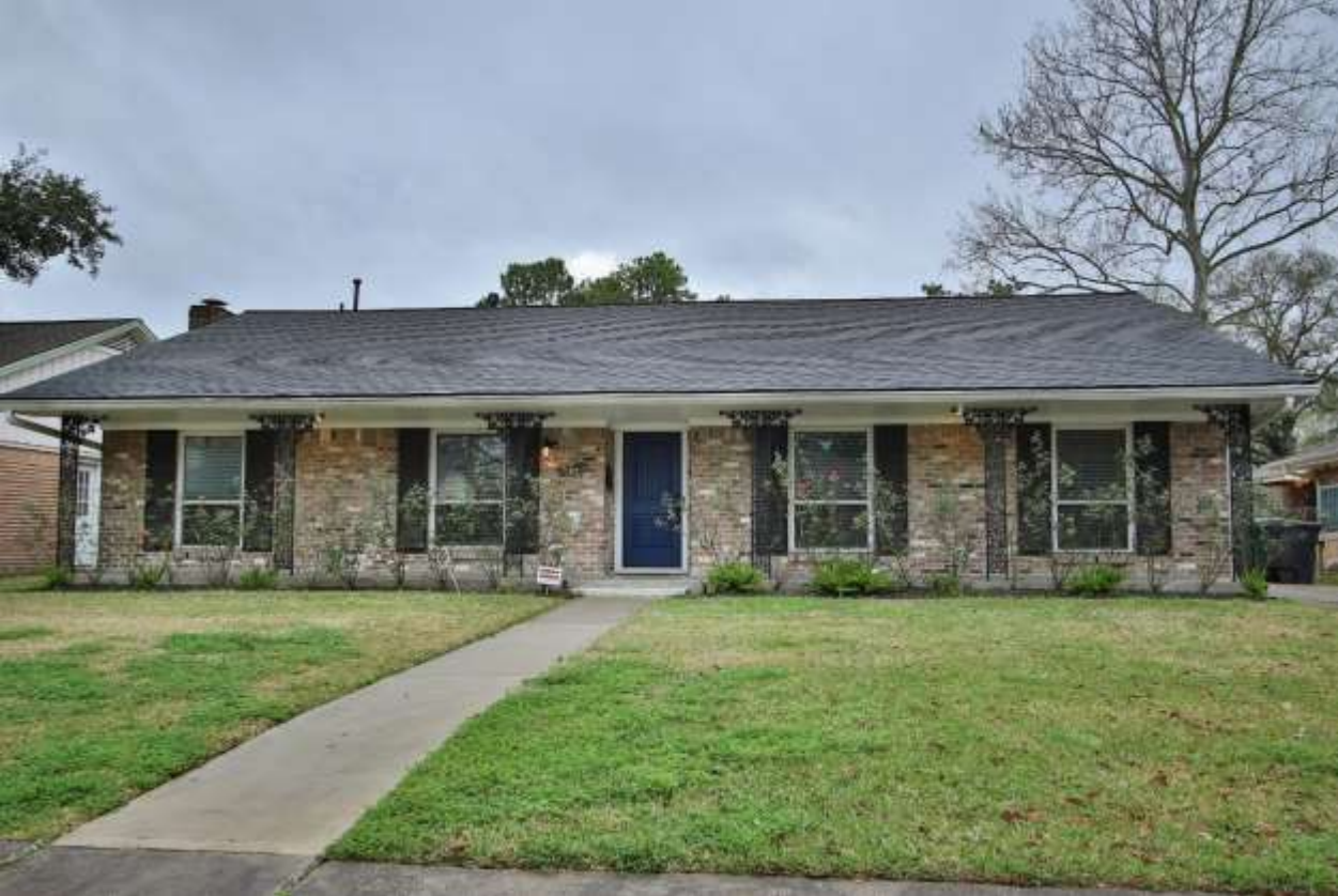
Front Elevation With Inviting Porch