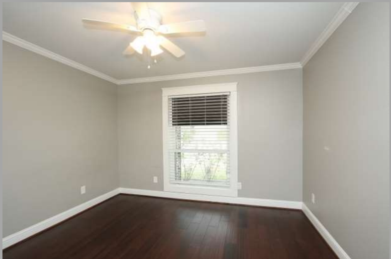
Two Views Of Secondary Bedroom One