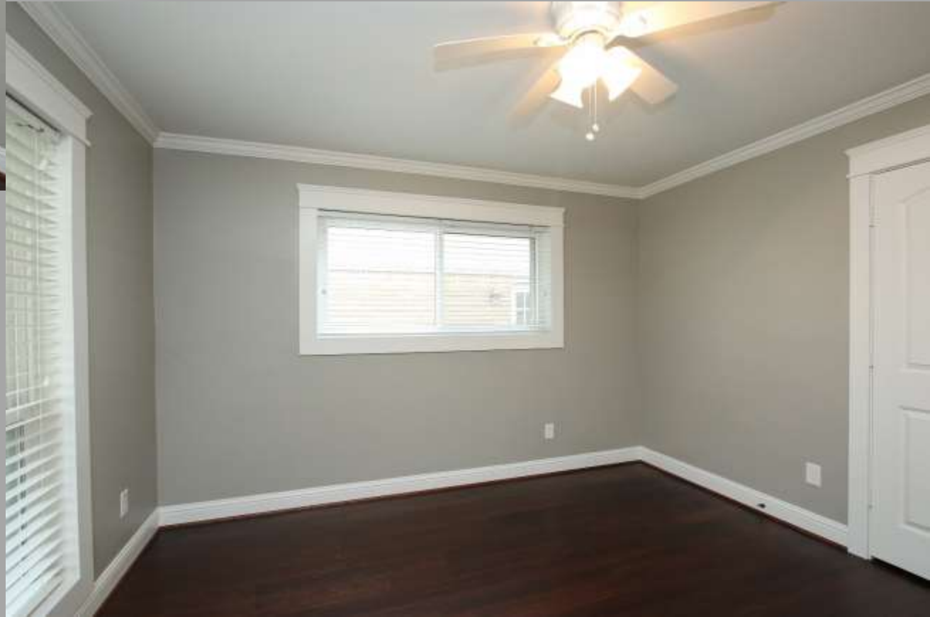
Two Views of Secondary Bedroom Two