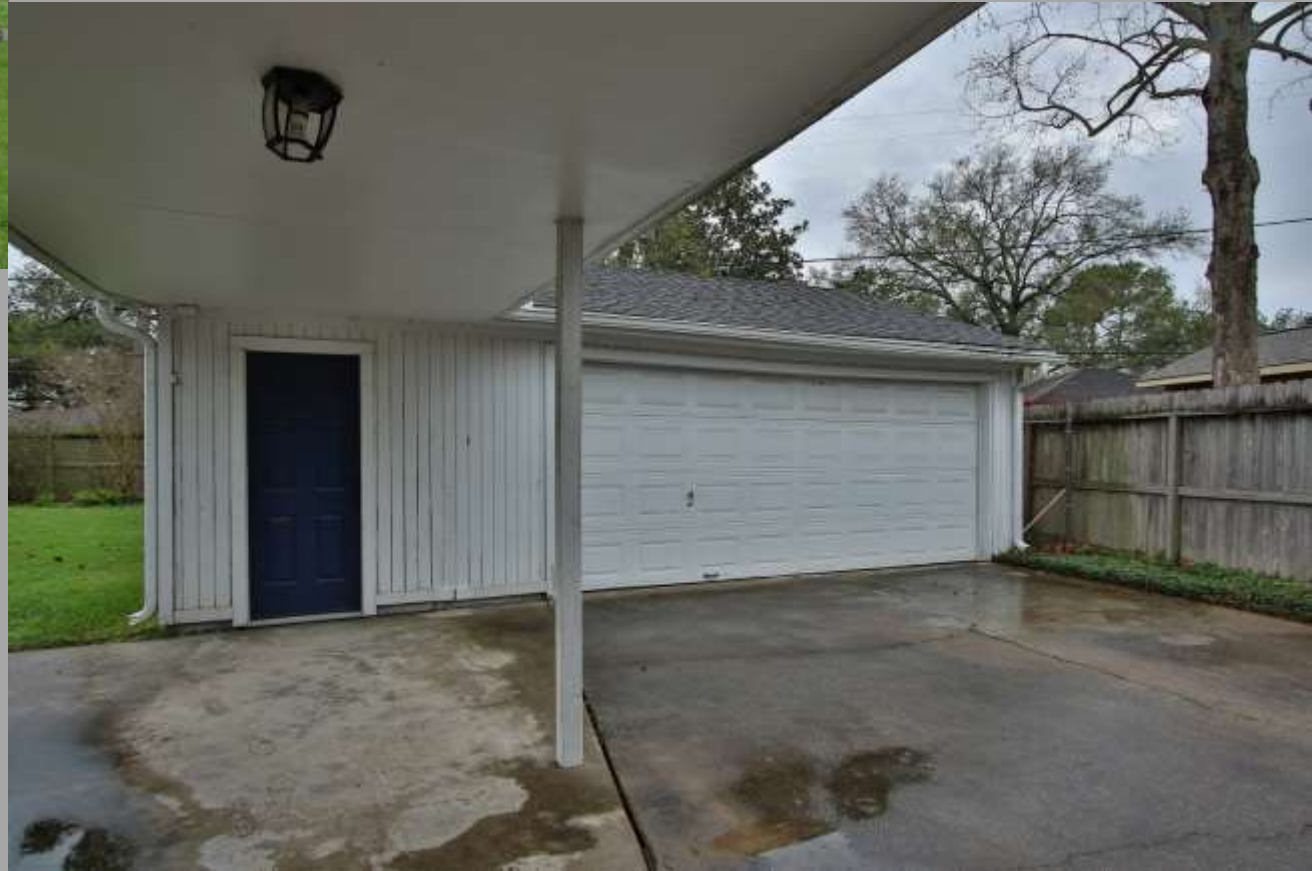
Oversized Garage Nearly Three Cars Wide With Separate Storage Room