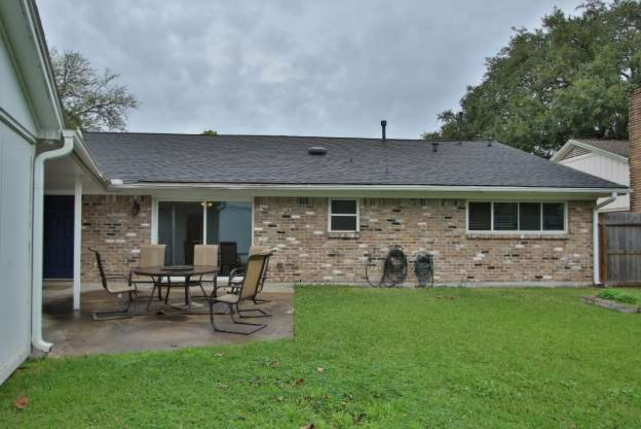
Back Patio and Covered Walkway to Garage