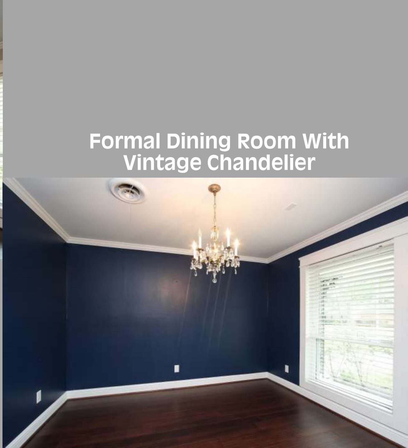
Formal Dining Room With Vintage Chandelier