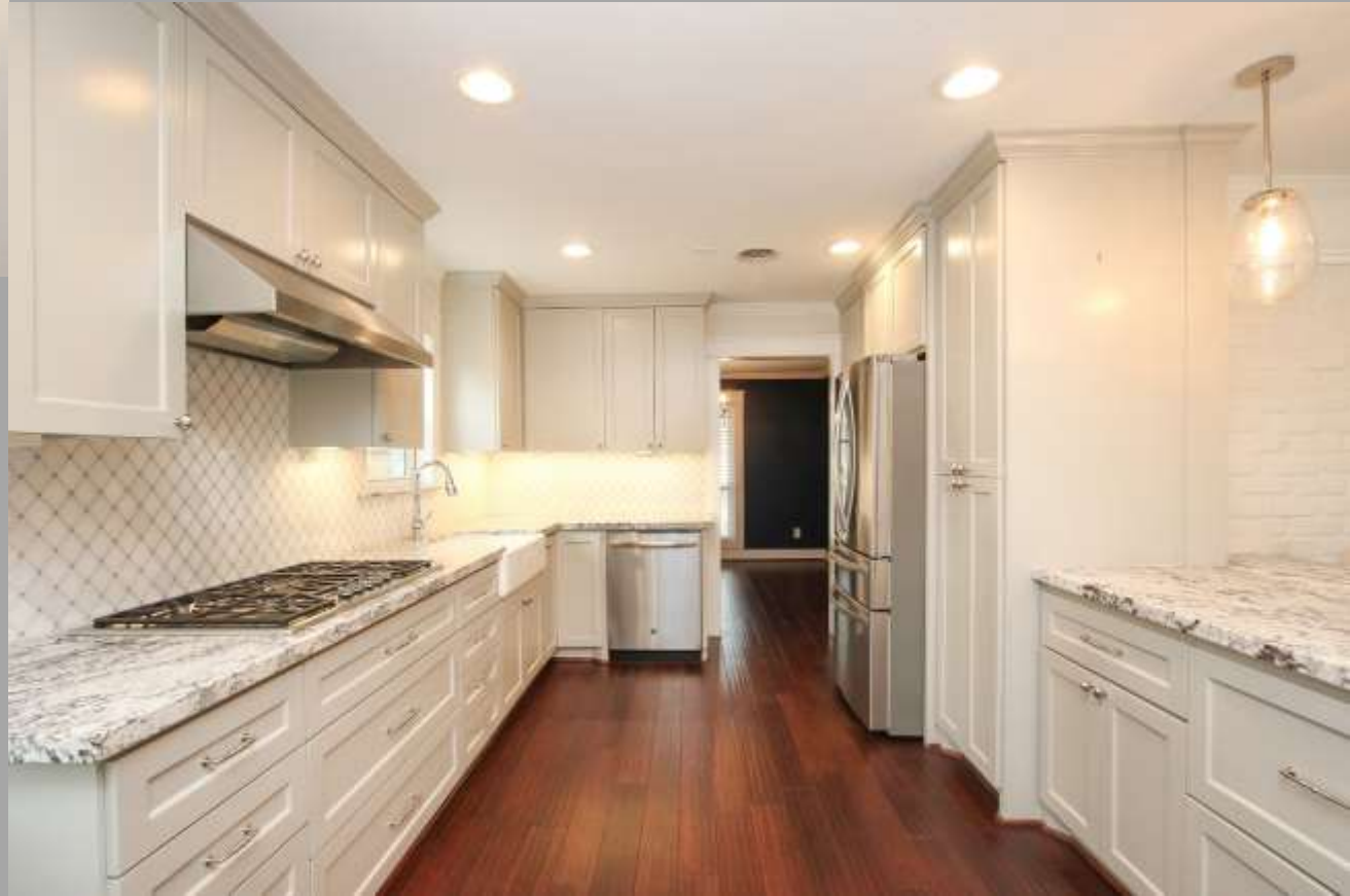
Extensively Remodeled Kitchen and Eat-In Peninsula