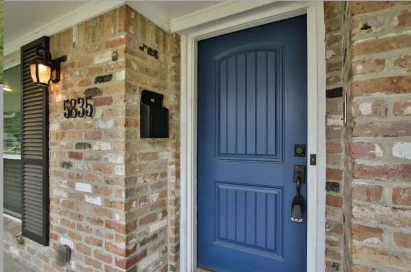
Front Entry With Stylish Blue Door