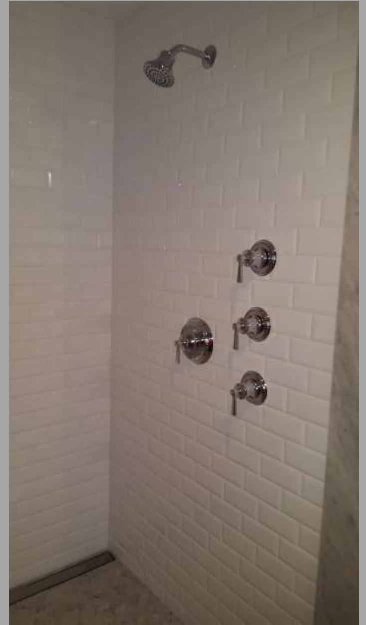
Three Views of The Upgraded and Expanded Primary Bath Shower With Rain Head, Hand Held, and Wall Mounted Sprayers Plus Marble Sitting Bench