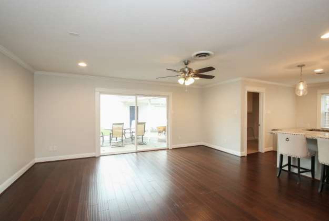
Additional Views of The Family Room, Dine-In Peninsula, and Upgraded Sliding Patio Door