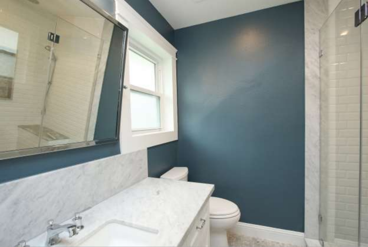
Upgraded Primary En-Suite Bath