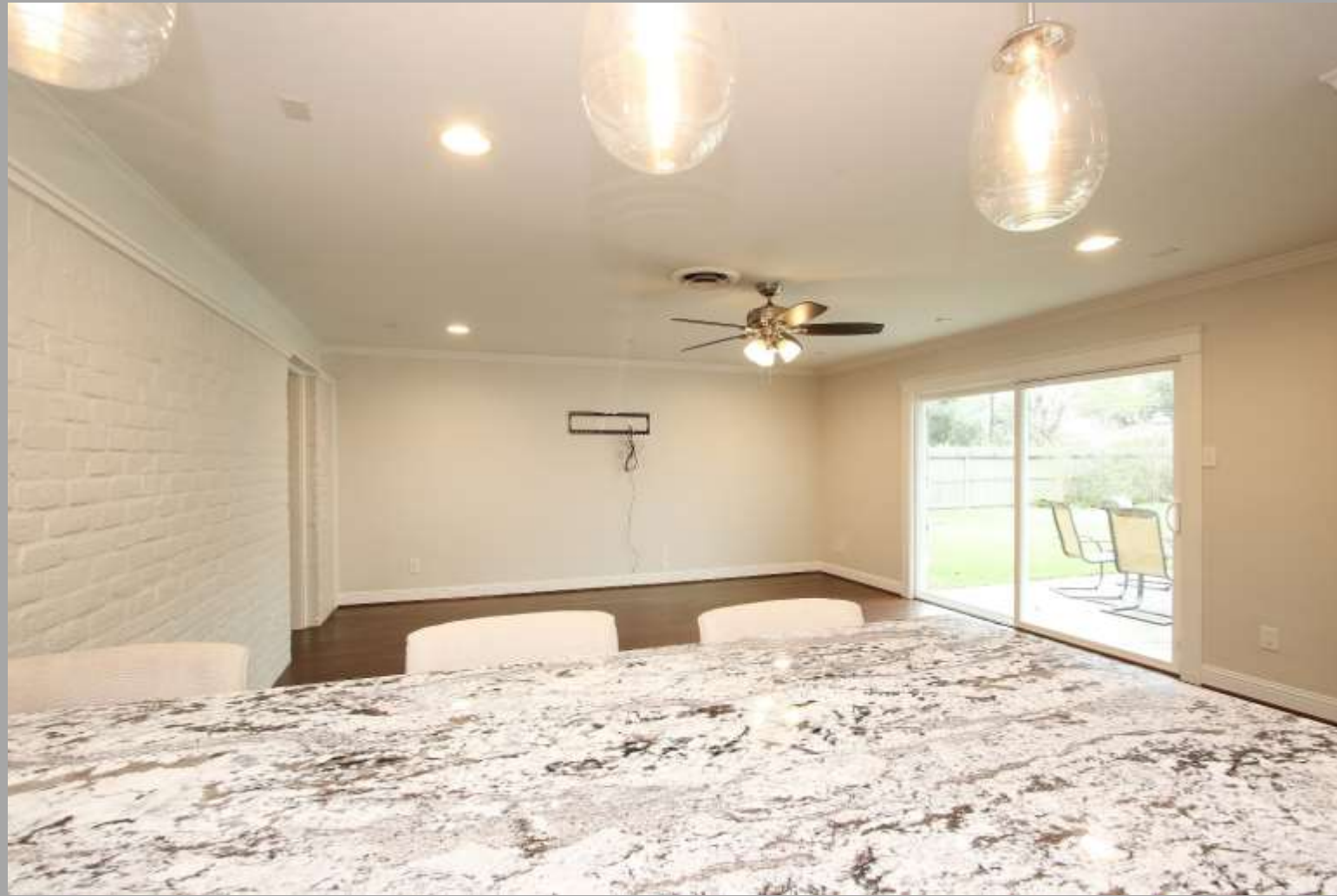
Family Room With Vintage Painted Brick Accent Wall and Eat-In Peninsula