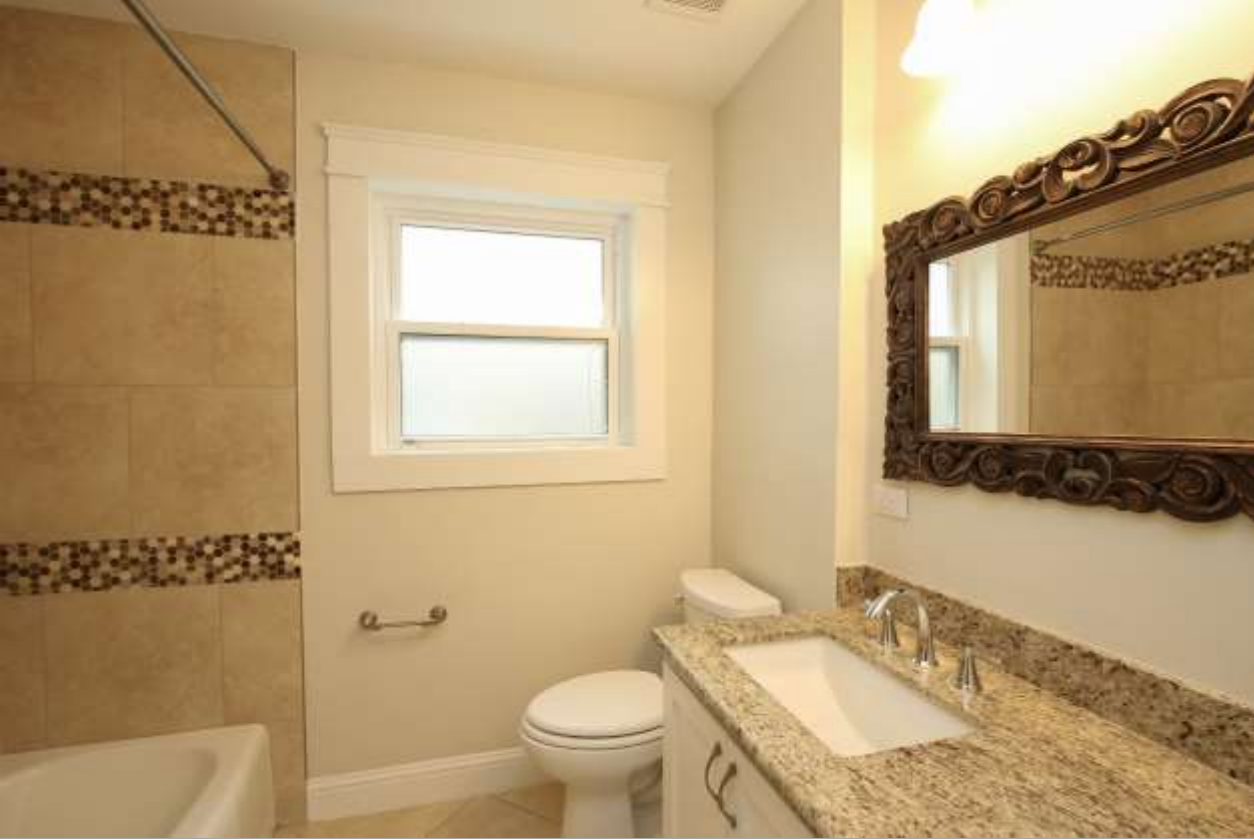
Two Views of Secondary Bathroom