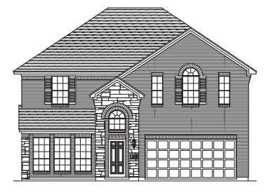
ELEVATION A (with stone option)