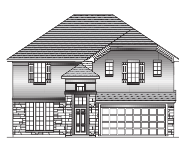
ELEVATION B (with stone option)