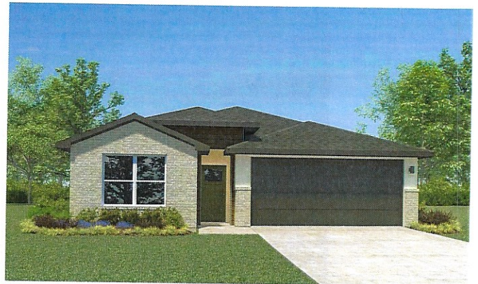
Elevation T w/ Optional Woodtone