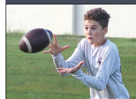
Sealy football camp, PAGE 7