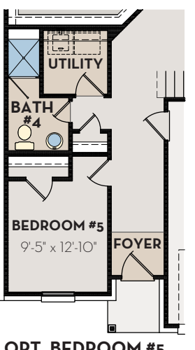
OPT. BEDROOM #5 OR PER ELEVATION