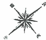
EXHIBIT "A" PAGE 2 OF 2

PLAT OF SURVEY OF LOT 5, BLOCK 2, SECTION 3 SHOREWOOD FOREST