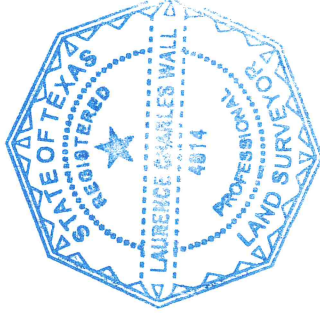
Laurence C. Wall RPLS #4814 July 23, 2013

This description has been prepared in conjunction with the survey plat attached hereto. Bearings described are assumed as platted.