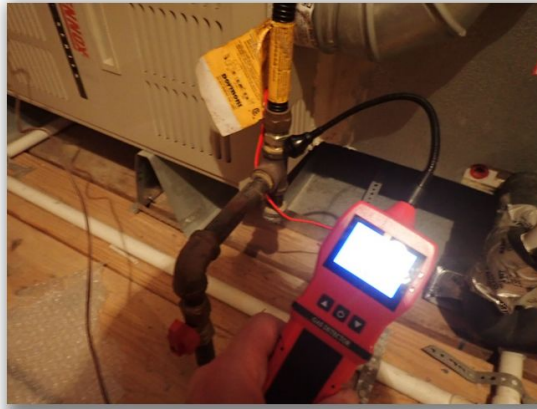
Central Heating System(2nd floor) – Energy Source: Gas Brand Name: Lennox

This component appears to be performing adequately at the time of this inspection. It is achieving an operation, function, or configuration consistent with accepted industry practices for its age.