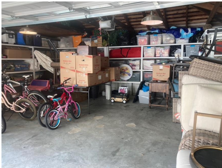
Obstructed view in the garage