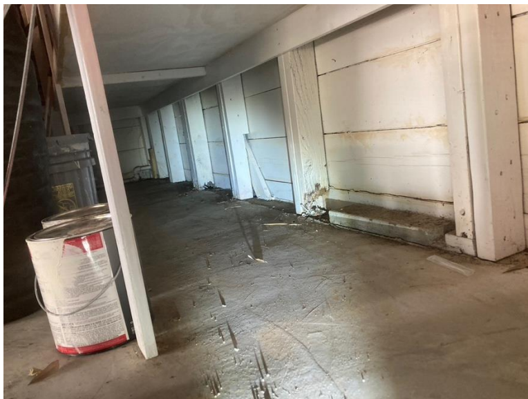
Evidence of Previous Beetle damage observed in the garage.