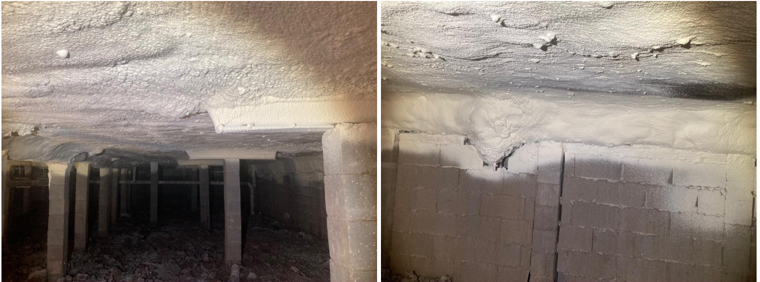
Obstructed view of the Sub floors