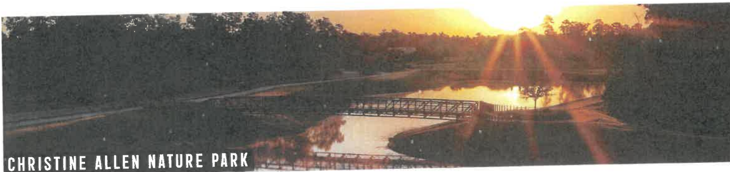
CHRISTINE ALLEN NATURE PARK

For families searching for new homes in an amenity-rich community, considering a special utility district (such as a MUD) is the viable, if not, preferred option.