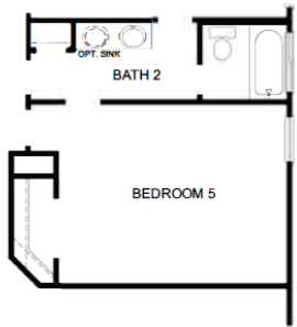
OPTIONAL BEDROOM 5